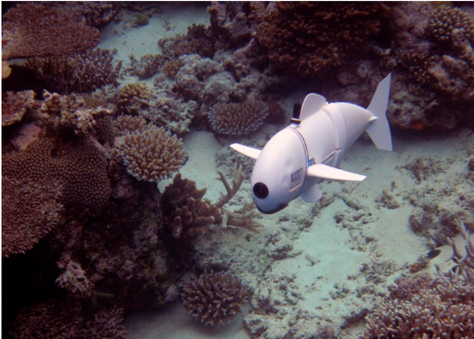
Figure 1 SoFi, the Soft Robotic Fish for Underwater Observatories

SoFi, the soft robotic fish swimming in a coral reef. See Robert K. Katzschmann, Joseph DelPreto, Robert MacCurdy, et al., “Exploration of Underwater Life with an Acoustically Controlled Soft Robotic Fish,” Science Robotics 3 (16) (2018).