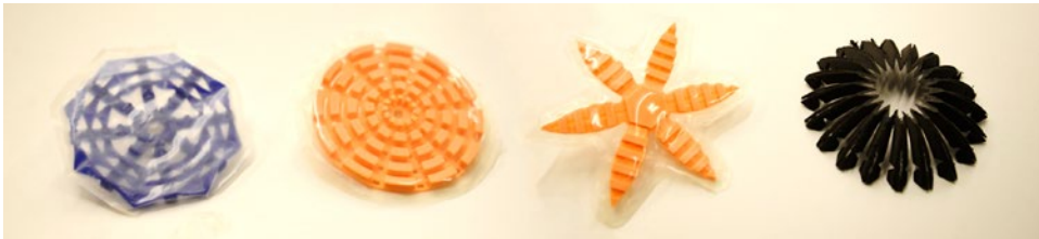
Figure 3 FOAM Grippers ( top ) and Objects that can be Handled with the Magic Ori- gami Ball (Tulip) Gripper ( bottom )