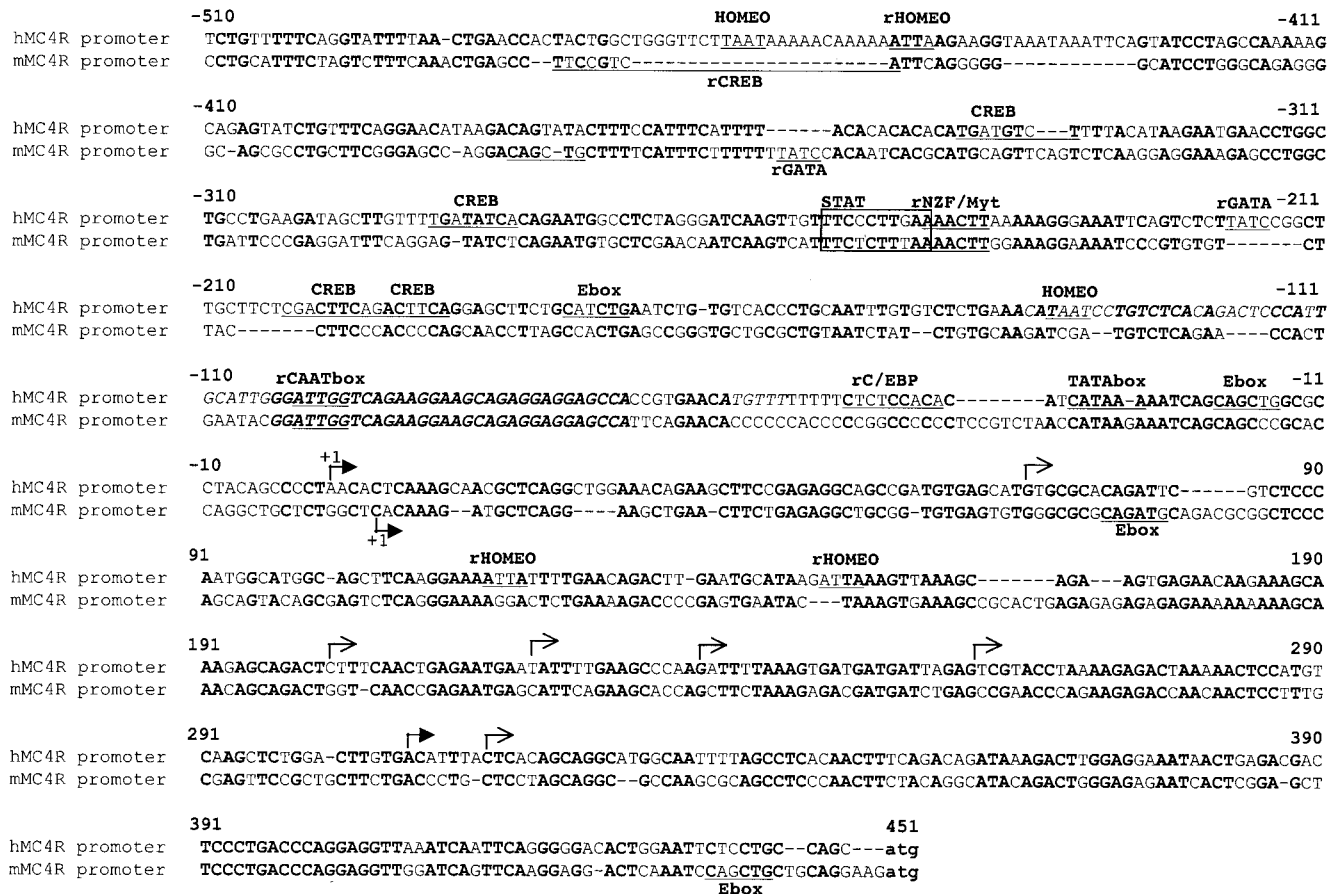
FIG. 2. DNA sequence alignment of human and mouse MC4R promoter regions. The major transcription start sites are indicated by a "plain" arrow and defined as +1. Minor transcription start sites are indicated only for the human sequence with "open" arrows. The translation initiation codon ATG is indicated in lower case. Conserved regions between human and mouse are indicated in bold. The minimal promoter region determined in this study is indicated in italics. Potential cis -acting elements were identified using the TRANSFAC database and manual searches and are indicated as underlined. Sequences present in reverse orientation are designated with the prefix "r".

and the search for genetic variants associated with obesity at the MC4R locus has so far been limited to coding mutations.