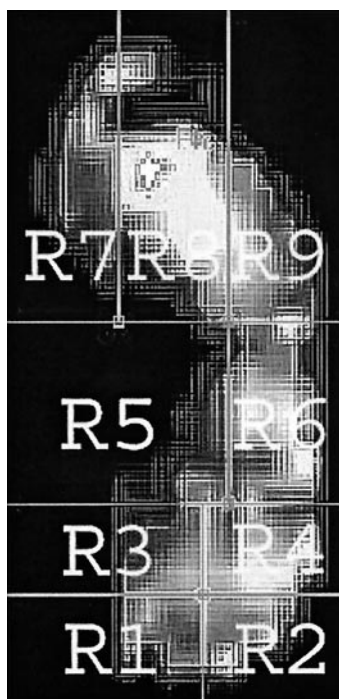
Figure 2 —The standard mask areas (R1–R9) that were used to divide the foot pressure readings into nine different anatomical regions.

On the test day, before the measurements were taken, the left and right feet were inspected for any signs of ulceration. Both the purpose of the study and protocol were again explained to each subject. The six shoe modalities were measured in a random sequence to anticipate any order effects. Subjects walked along a 20-m