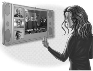
Figure 2 Drawings of a storyboard for MyVideos .

them to empathize with (imaginary) users and their experiences, and to more vividly imagine the sort of problems that TA2 aims to solve.