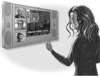
Figure 2 Drawings of a storyboard for MyVideos .

them to empathize with (imaginary) users and their experiences, and to more vividly imagine the sort of problems that TA2 aims to solve.