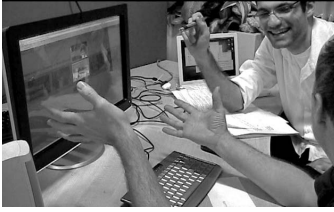
Figure 3 Prototype and user test of MyVideos .

experiences, to discuss and negotiate their roles and interests, and to jointly bring about positive change. Co-design participants combine inquiry —a move from the outside world and others to the inside world, so that they can be curious and jointly learn—and imagination —a move from the inside world to the outside world and others, so that they can be creative and jointly bring about change.