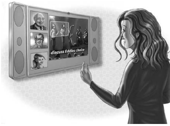
Figure 2 Drawings of a storyboard for MyVideos .

them to empathize with (imaginary) users and their experiences, and to more vividly imagine the sort of problems that TA2 aims to solve.