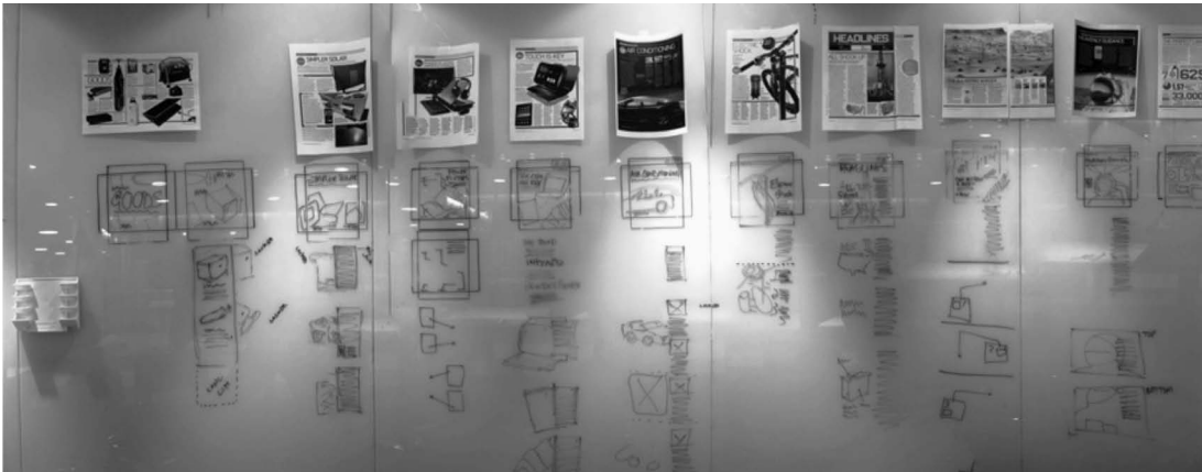
Figure 3 Magazine architecture exercise.

We cut out every page of the magazine and taped it onto a whiteboard, and then we sketched below it in marker what the architecture of the translated Mag+ version would be for that page. The exercise of going through that, looking at all these different types—from the cover to the editor's letter to complicate it, gadget pages to long features—the process of really trying to go through that translation and having both the guys from Berg, our art director, and myself, all debating these things, really helped to inform the rest of the process. 25