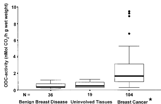
Fig. 1 Box plot of ODC activity in breast cancer, benign breast diseases, and uninvolved breast tissue. In this representation, the central box covers the middle 50% of the data values, between the upper and lower quartiles. The bars extend out to extremes, whereas the central line is at the median. Values that are 1.5 times the interquartile range beyond the central box are plotted as individual points. N , number of patients. *, P < 0.001 versus the other groups.

mm pyridoxal phosphate. The extract was centrifuged for 1 h at 105,000 \times g and the supernatant fraction was used as the enzyme source. ODC activity was determined according to Russell and Snyder (35), by measuring the release of ^{14}\text{CO}_2 from 38 \mu\text{M} 1\text{-}^{14}\text{C}\text{-L-Ornithine} (specific activity, 56 Ci/mol). ^{14}\text{CO}_2 -release was totally inhibited by 0.1 mM \alpha\text{-DFMO} . In large tumors, different homogenates from small portions from the same tumor gave ODC values with a variation coefficient <10\% .