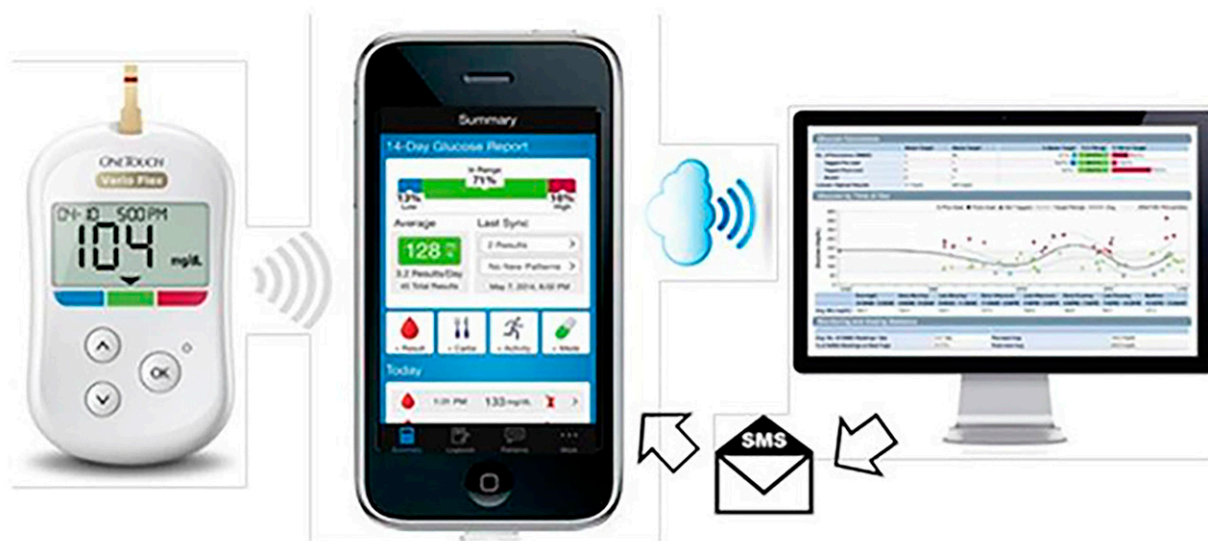
FIGURE 2 Subject data flow. Test (baseline to week 24) and control (week 12 to week 24) subjects used the OT Verio Flex meter to conduct BGM according to the schedule suggested by their HCP. BGM data were transmitted wirelessly from the meter to the smartphone containing the Spanish-language version of the diabetes management mobile app OT Reveal. BGM data were automatically uploaded via the Cloud to a Web-based version of the app accessible to the HCPs on their office computers. HCPs reviewed the 14-day Web-based report for each subject to assist in formulating diabetes-related text messages sent to the subjects' smartphone.

had type 2 diabetes, and 95% were of Hispanic or Latino ethnicity. Nearly all had never used diabetes management software or had their HCP download their blood glucose data from their meter. More than half of the subjects had either no formal education (16%) or only primary school education (50%); 32% had some secondary or technical school training, and only 2% had some college education. More than half of the subjects listed home management (33%); farming, fishing, and forestry (11%); or construction/maintenance (8%) as their occupation. Sixty percent of patients were on oral medication, and the remainder were using mealtime or basal insulin. Seventy of the 120 subjects were provided smartphones. Loading of the app on the phone was done by clinic staff in about 85% of the cases. Synchronizing of blood glucose data were automatic each time the subject opened the app.