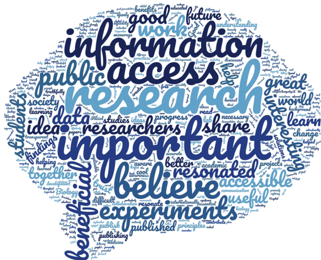
Figure 2. Image created at https://www.wordclouds.com/ by Sharon Hanna in February 2020 from the text of attitudinal survey responses.

Below is a “wordle” created from the text of students’ survey responses (Figure 2):