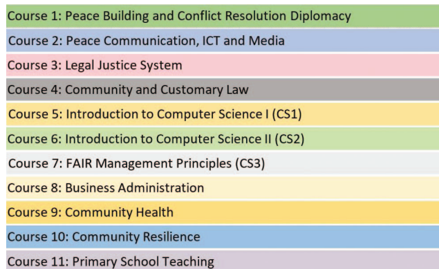
Figure 3. DISH courses.

The project contains 11-courses each offered over a period of 12 weeks. The participants are allowed to pick appropriate courses, as they see fit, according to their interests and specialisations. Figure 3 shows the 11 courses offered by the project.