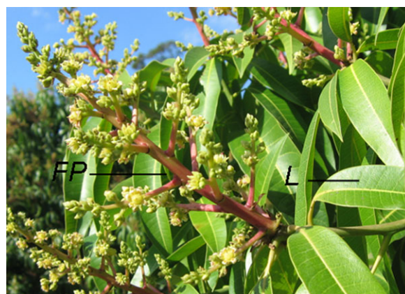
Fig. 2. Floral induction in mango occurs in response to cool temperatures perceived by mature leaves (L), which are necessary for floral initiation. Flower panicles (FP) originate from terminal or subterminal buds of the most recent vegetative flush.

Most mango cultivars bear irregularly. This has been largely attributed to variation in flowering and, in subtropical areas, fruit retention (Whiley, 1993). Variations in the amount of flowering may be within trees from year to year, between trees in the same year, and between branches on the same tree. Some Indian cultivars are reputedly biennially bearing, having distinct ‘on’ and ‘off’ years (Pandey, 1989).