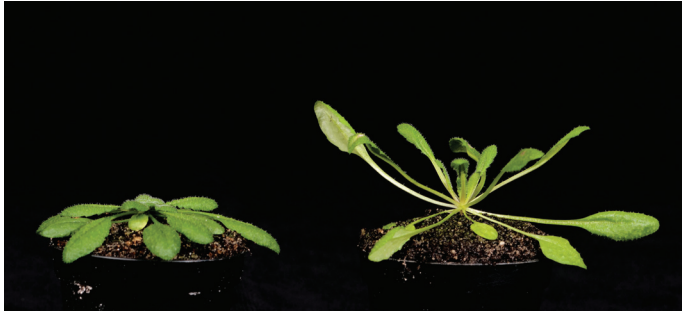
Fig. 1. Arabidopsis thaliana in control light (left, white light HPI lamps, 150 \mu\text{mol m}^{-2} \text{s}^{-1} PAR) or simulated canopy shade (right, HPI filtered through Lee Fern Green filter, 50 \mu\text{mol m}^{-2} \text{s}^{-1} PAR). In canopy shade (low PAR, low B, and low R:FR), A. thaliana shows classic shade avoidance features including elevated leaf angles (hyponasty) and elongated petioles. Plants were grown for 30 d at 20^\circ\text{C} and 70% relative humidity under 9/15 h light/dark cycle under control light conditions until the last week where the plants on the right was moved to canopy shade light (this figure is available in colour at JXB online).

organ elongation include various physiological components and processes that control cell-wall extensibility including expansins, XTHs, and cell-wall acidification (Sasidharan et al. , 2008, 2010).