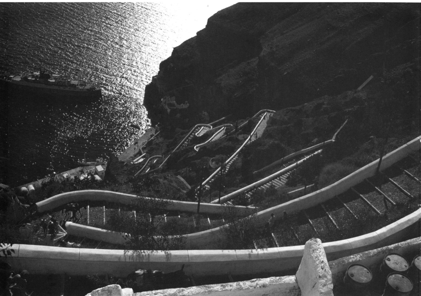
1 Cordonata in Santorini, the Cyclades, Greece