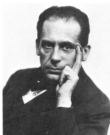
Walter Gropius, 1920