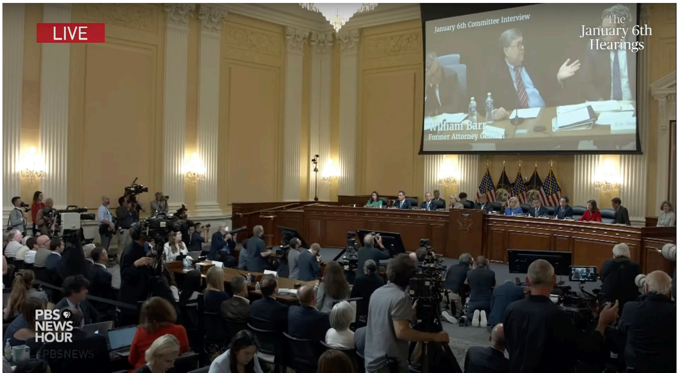
Former Attorney General William Barr testified via Zoom for the Select Committee.

Klan, and lynching.” With gravelly solemnity and restrained cadence, Thompson went on to recall Abraham Lincoln’s pledge that he would accept the outcome of the 1864 presidential election “come what may.” Lincoln allegedly feared that his opponent, General George McClellan, would dissolve the Union if he won. And yet, Thompson intoned, Lincoln vowed “to uphold the rule of law, to do what every president who came before him did, and what every president who followed him would do, until Donald Trump.” Thompson’s oratorical delivery underscored the gravity of the January 6 riot by locating it in the long history of American travesties—specifically, racist travesties—and juxtaposing Trump’s bid for power with the selfless patriotism of another Republican president.