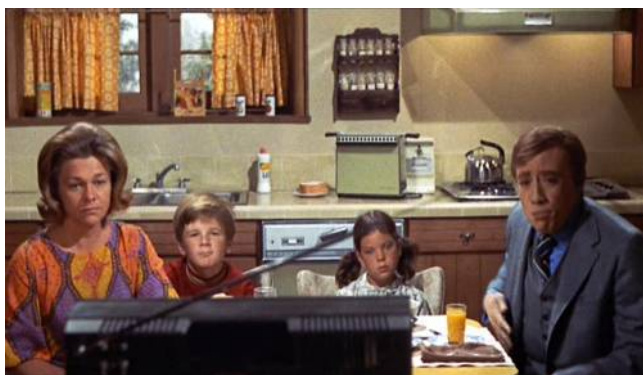
Jeffrey Gerber and his family in a mundane, sitcom styled scene of white middle class life in the opening scene of Watermelon Man .