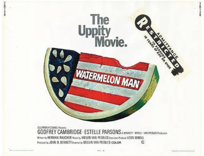
Columbia Studio publicity images demonstrate how Watermelon Man was marketed to audiences, including behind the scenes shots of director Melvin Van Peebles blocking scenes with lead actors Godfrey Cambridge and Estelle Parsons.