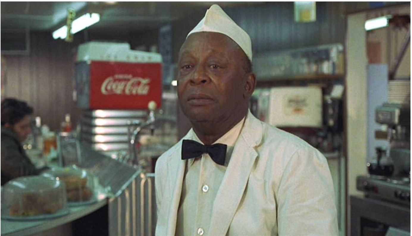
Van Peebles's direction and Mantan Moreland's acting function as a meta-critique of Hollywood's history of racist representations in Watermelon Man .

racist society beneath a constricting mask of public joviality in his poem "We Wear The Mask." The first stanza is an apt description of Moreland's momentary dropping of his own mask in Watermelon Man :