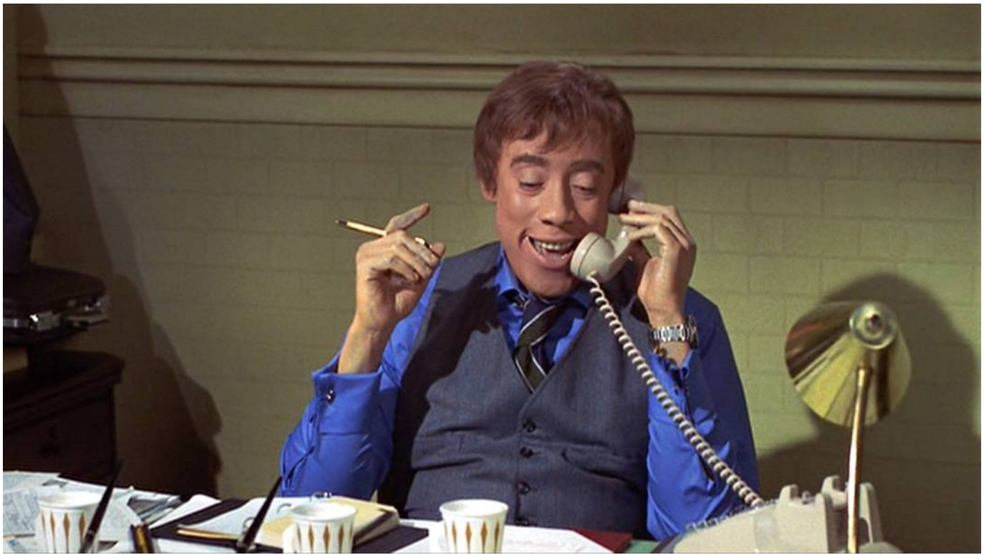
Black actor Godfrey Cambridge in character as Jeffrey Gerber in a rare instance of whiteface in the Hollywood studio production Watermelon Man .

the lead role in Watermelon Man , which would have involved the actor spending the majority of the film in blackface. 12 Because the lead character is only white for ten minutes or so before turning black, Van Peebles convinced them to cast an African American actor in the role instead. Comedian/actor Godfrey Cambridge eventually won the part. Van Peebles's substitution of whiteface for Columbia's desired blackface marks a radical and subversive shift: a direct black critique of whiteness as a response to a studio attempt to preserve the problematic trope of white actors "blacking up" to portray black characters.