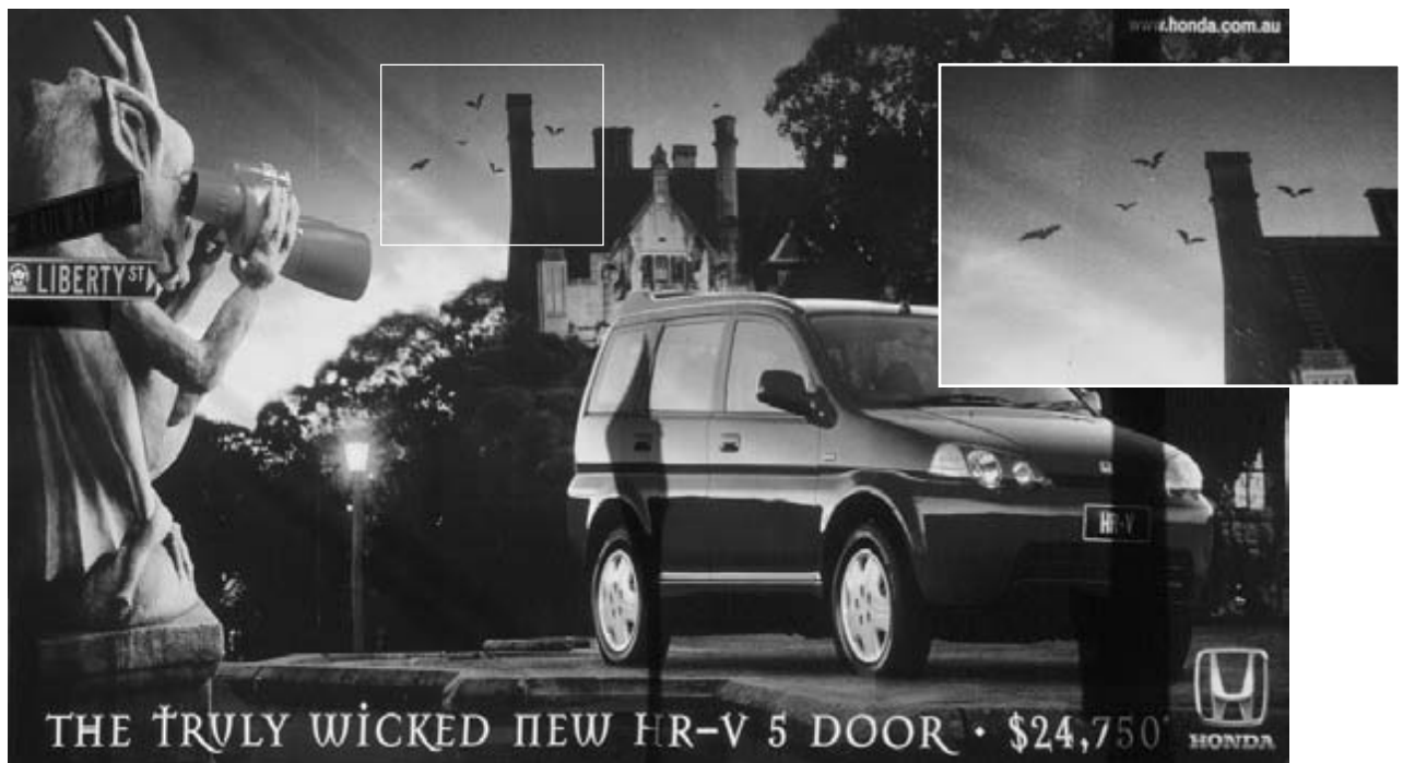
Fig. 4. The gargoyle is watching the “truly wicked” new Honda. To give the picture an air of verisimilitude, the symbols of wickedness abound. The bats around the chimney are shown more clearly in the inset, which was a close-up of this billboard advertisement in Stanmore, NSW. The classification of ‘wicked’ is a precursor to legitimising the destruction of bats, not to mention neglect of this major Order of Australian mammals. “Liberty” as the street name in the foreground is a delightful contrast to withdrawal of liberty for the bats. About one quarter of the native mammal fauna of Australia are bats. Such advertisements trade on European myths that had no foundation in the first place and are now being applied to our Australian fauna. It demonstrates that there will need to a revolution to appreciate Australian bats, their value and the need to study them and prepare plans for their conservation.

37 species of bats are officially threatened, but in the ad we see declining species portrayed as evil creatures. Not only is the implication of the ad disturbing from a conservation point of view, but the zoology is wrong. The bats in question look like flying-foxes. These large fruit bats are not the blood-sucking bats of European mythology that have given all small insectivorous bats such a stigma. On the contrary, these large flying-foxes are fruit- and nectar-eaters and they are fading in NSW (Eby et al. 1999), with two species, the Black Flying-fox Pteropus alecto and the Grey-headed Flying-fox listed as threatened. This terrible advertisement was put up shortly after the magnificent exhibition on bats closed at the Australian Museum. By comparison with the space and reach of the Honda advertisement, the Australian Museum exhibition had but a minor impact. Our dislike of the advertisement does not blight our perception of this Honda model, but it does show just how difficult it is to turn community values away from the old European outlook that has been so inappropriate for Australian landscapes, seasons and fauna.