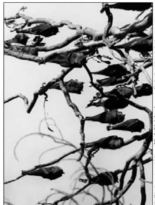
Who'll be the next snack? Some of the fruit bats hanging around in the Royal Botanic Gardens . . .