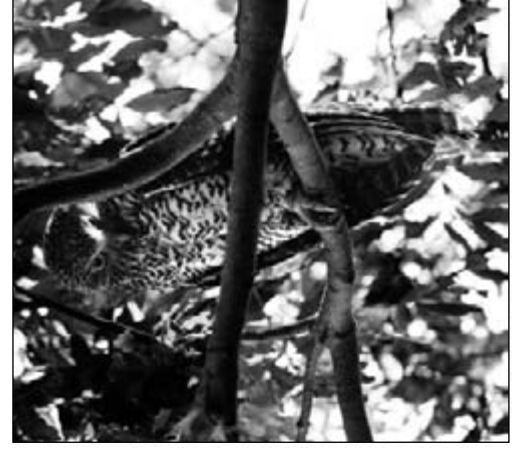
as the owl sizes up his next victim.