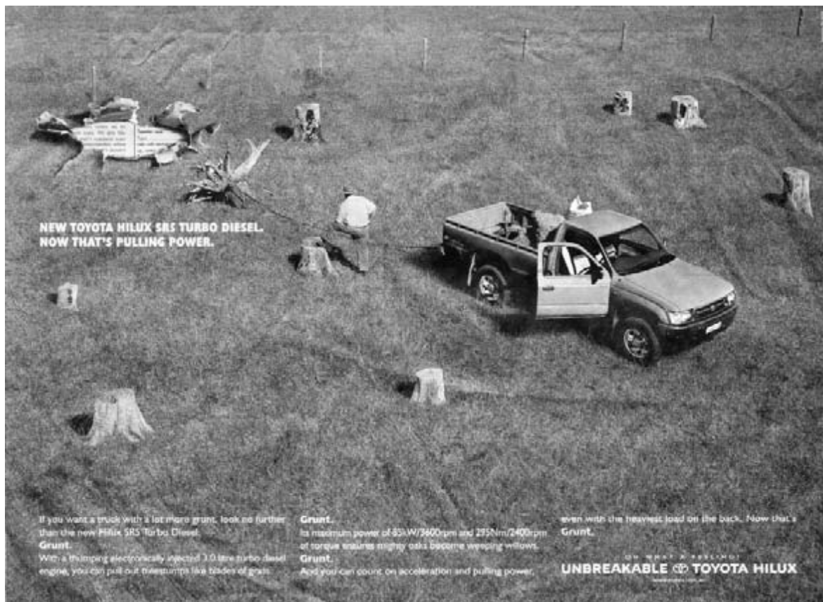
Fig. 1. This graphic half-page advertisement in the Sydney Morning Herald on 27 March 2000 illustrates the application of 21st century technology to 19th century thinking. Here stumps are being grubbed from a grassy paddock, and with their disappearance go the last the remnants of what would have been a forest in 1788. It will take a revolution to prevent the last vestiges of our native faunal habitats being progressively modified and cleared. If Australia's rich zoological heritage is to survive, there needs to be a much sharper appreciation of the impact of our agricultural enterprises on our fauna.

An appalling land-use ethic can often be found in the media where its effects are all the more insidious for being subliminal. For example, in the Sydney Morning Herald (Monday, 27 March 2000) there was an advertisement for the unbreakable Toyota Hilux which emphasised the vehicle's extra pulling power. The small print said, "If you want a truck with a lot more grunt, look no further than your Hilux" (Fig. 1). A critical examination of the photograph of the Hilux in context is most revealing. The Hilux was pulling out the last remaining stumps in a grassy paddock. The stumps are, of course, the last vestige of native habitat in what would have originally been, judging from the size of the stumps, a forest. So, there was a forest, cleared, turned to grass, and now the last bit of