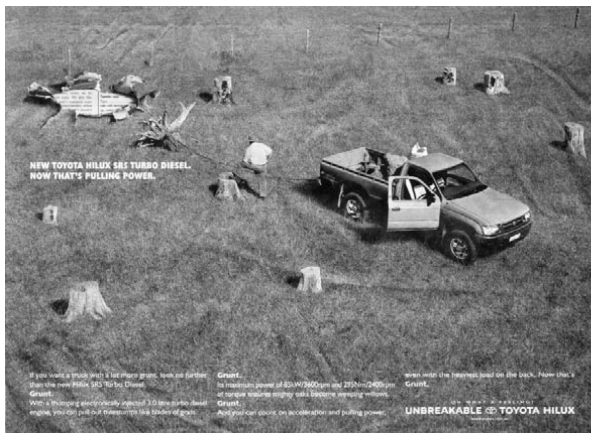
Fig. 1. This graphic half-page advertisement in the Sydney Morning Herald on 27 March 2000 illustrates the application of 21st century technology to 19th century thinking. Here stumps are being grubbed from a grassy paddock, and with their disappearance go the last the remnants of what would have been a forest in 1788. It will take a revolution to prevent the last vestiges of our native faunal habitats being progressively modified and cleared. If Australia's rich zoological heritage is to survive, there needs to be a much sharper appreciation of the impact of our agricultural enterprises on our fauna.

An appalling land-use ethic can often be found in the media where its effects are all the more insidious for being subliminal. For example, in the Sydney Morning Herald (Monday, 27 March 2000) there was an advertisement for the unbreakable Toyota Hilux which emphasised the vehicle's extra pulling power. The small print said, "If you want a truck with a lot more grunt, look no further than your Hilux" (Fig. 1). A critical examination of the photograph of the Hilux in context is most revealing. The Hilux was pulling out the last remaining stumps in a grassy paddock. The stumps are, of course, the last vestige of native habitat in what would have originally been, judging from the size of the stumps, a forest. So, there was a forest, cleared, turned to grass, and now the last bit of