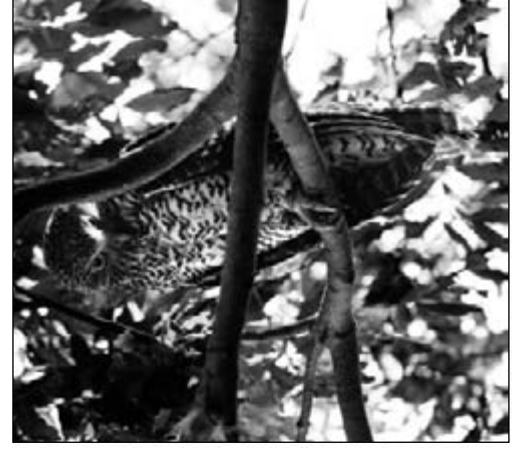
. . . as the owl sizes up his next victim.