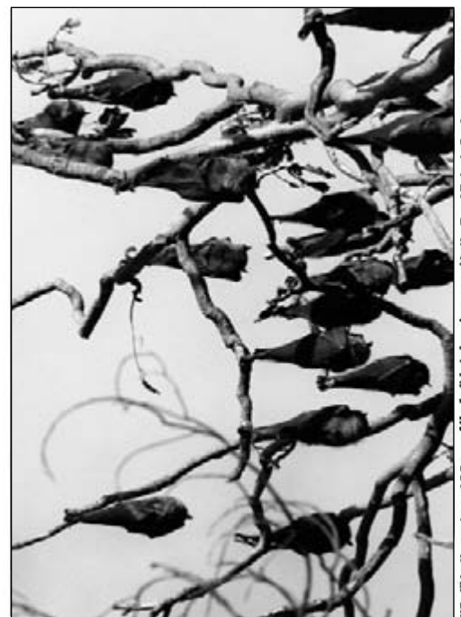
Who'll be the next snack? Some of the fruit bats hanging around in the Royal Botanic Gardens . . .