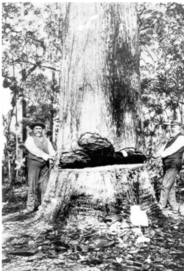
Figure 6. Sir John Forrest, once Premier of Western Australia (left) and Sir William Lyne (a Commonwealth politician) felling a jarrah tree c. 1907.

When what remains of the present over-mature crop of jarrah and karri has been cut down, it is unlikely that specimens equal in bulk to what the forests have already yielded or still possess will be seen by future generations. When the State's forests have become "cultivated", trees will be cut when they reach maturity. Sentiment may dictate the preservation of a few for a period far beyond that of maturity, as reminders of the giants of former days, but whole forests of giant trees will no longer be seen. Lane Poole (1920, p. 130)