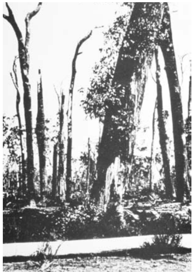
Figure 3. Photographic evidence of 'The remains of a jarrah forest devastated by fire from the massive accumulation of debris following early logging'.