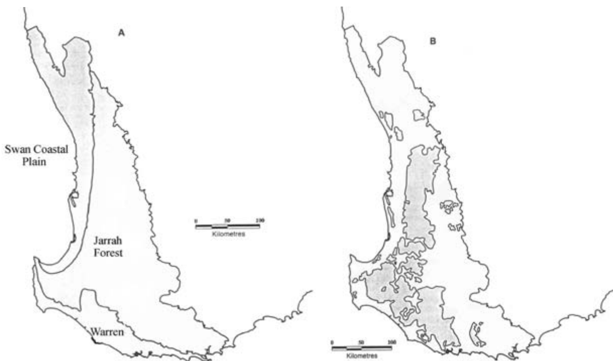
Figure 1. (a) The IBRA bioregions in south-western Western Australia (after Thackway and Cresswell 1994). (b) Distribution of State forest within the IBRA bioregions (after Calver and Dell 1998a).

The forested ecosystems of south-western Australia occur over an area of about 4.25 million hectares in three biogeographic regions: Swan Coastal Plain, Jarrah Forest and Warren (IBRA bioregions sensu Thackway and Cresswell 1994) (see Figure 1a for the bioregions and Figure 1b for the extent of State forest within them). They comprise most of Western Australia's commercially important hardwood forests, including the major timber species jarrah as well as karri E. diversicolor ; the latter occurs mainly in the Warren. Marri Corymbia calophylla , a less important timber tree, often co-occurs with jarrah or karri. In each of these bioregions, forests occur in a matrix of vegetation types reflecting an extraordinarily long and complex geological and climatic history. Jarrah exhibits a variety of growth forms and occurs in a range of community types throughout the region (Wardell-Johnson et al. 1997). Detailed accounts of the distribution, history, silviculture and ecology of the jarrah forests can be found in Abbott and Loneragan (1986), Dell et al. (1989), Shearer and Tippett (1989), Bradshaw et al. (1991) and Wardell-Johnson et al. (1997). The importance of the jarrah forests for timber production was emphasised by Rodger (1952, p.18):