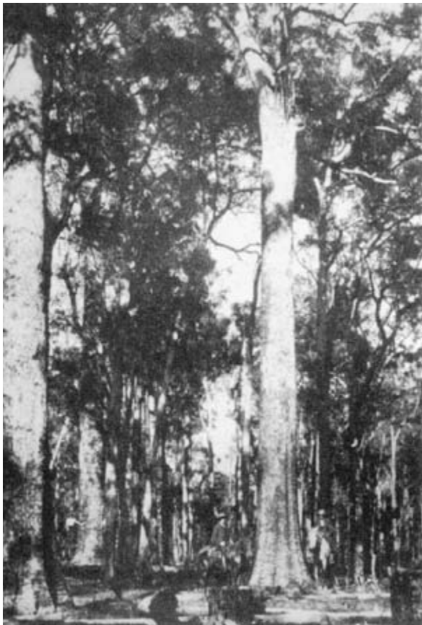
Figure 2. Jarrah forest near Jarrahdale, c. 1895. The riders in the foreground give a sense of scale (reproduced from Lane Poole 1920b, with permission of the Department of Conservation and Land Management).

Central to policy was increasing the area of State forests, reducing the rate of logging to within the growth increment of the forests, extensive reforestation on cut-over areas, removal of over-mature, senescent trees and