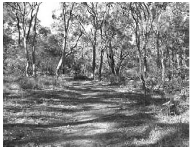
Figure 5. Path through Girrahween Park, Wollie Creek Valley, Bardwell Park.

Four of the reserves had been ringed by residential development for over 50 years while the University of Western Sydney, Richmond Campus (UWS) was in peri-urban Sydney. All of these sites suffer continual disturbance. By contrasting the herpetofauna of the four more urban 'island' reserves with the peri-urban UWS site, a pattern of species susceptibility to urban influences was identified. Our aims were to 1) identify species at risk from urbanisation, and 2) highlight the plight of urban herpetofauna and the need for conservation.