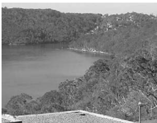
Figure 6. H.D.Robb Reserve, Middle Harbour Bushland Reserves, Castle Cove.

The bushland consists of Sydney Sandstone Gully Forest 10ag (Benson and Howell 1994). Dominant species in closed gullies are Water Gum Tristania laurina with occasional Coachwood Ceratopetalum apetaulum . Open gullies are dominated by Turpentine Syncarpia glomulifera and Blackbutt while dominant species in the more open, flatter woodland areas are Sydney Red Apple and Red Bloodwood.