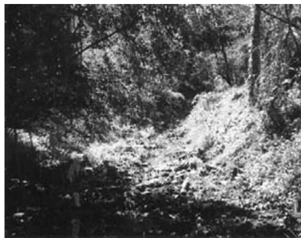
Figure 11. Castlereagh woodlands, one of the transition vegetation types of the Cumberland Plain, present in the University of Western Sydney, Richmond campus site showing representative structure of the woodland.

Situated on the core of the Richmond campus, the site covers about 575 ha of bushland, incorporating the university farm's 'Bush Block', and adjacent vegetated areas. In addition to this remnant bushland (Figure 10), the core campus incorporates university infrastructure, a working dairy farm and other bushland remnants. Surrounded by roads it abuts the township of Richmond, university farmland, remnant bushland and rural residential development. The area is flat (i.e. elevation