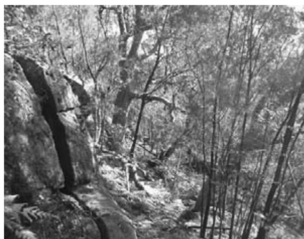
Figure 7. Angophora woodland, Explosives Reserve, Middle Harbour Bushland Reserves, Castle Cove.

The Sydney Sandstone Complex occurs on shallow soils (eg. exposed ridge tops, steep hill sides). The dominant species in these woodlands are Red Bloodwood, Scribbly Gum Eucalyptus haemastoma and often a heath understorey is present that contains Heath