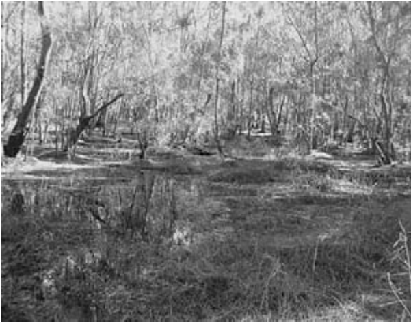
Figure 2. Freshwater wetland, Hawthorne Street Natural Area, Rockdale Wetland Corridor