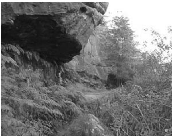
Figure 4. Sandstone escarpment, Wollie Creek Valley, Earlwood.