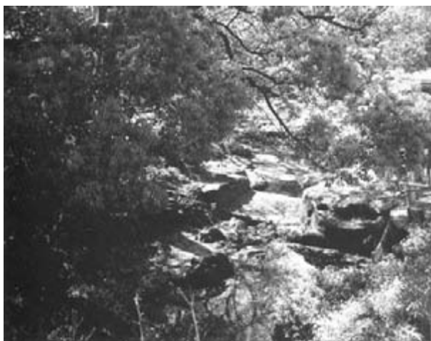
Figure 10. University of Western Sydney, Richmond campus site looking from agricultural lands at abutting woodlands of the Cumberland Plain.

Banksia , Dagger Hakea Hakea teretifolia , Black She-oak Allocasuarina littoralis and various epacrids.