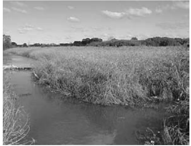
Figure 3. Patmore Swamp, Rockdale Wetland Corridor