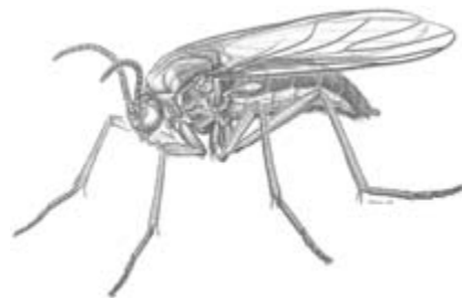
Figure 2. Family Sciaridae, general appearance of female Sciara (Manual of Nearctic Diptera, vol 1. Research Branch, Agriculture Canada, Ottawa.).

It is well known that season strongly affects invertebrate abundance and activity levels. The insects collected on the sticky traps were predominantly winged adults and, since most undergo complete metamorphosis (egg-larva-pupa-adult), their immature stages are both hidden in a different habitat and usually unidentifiable.