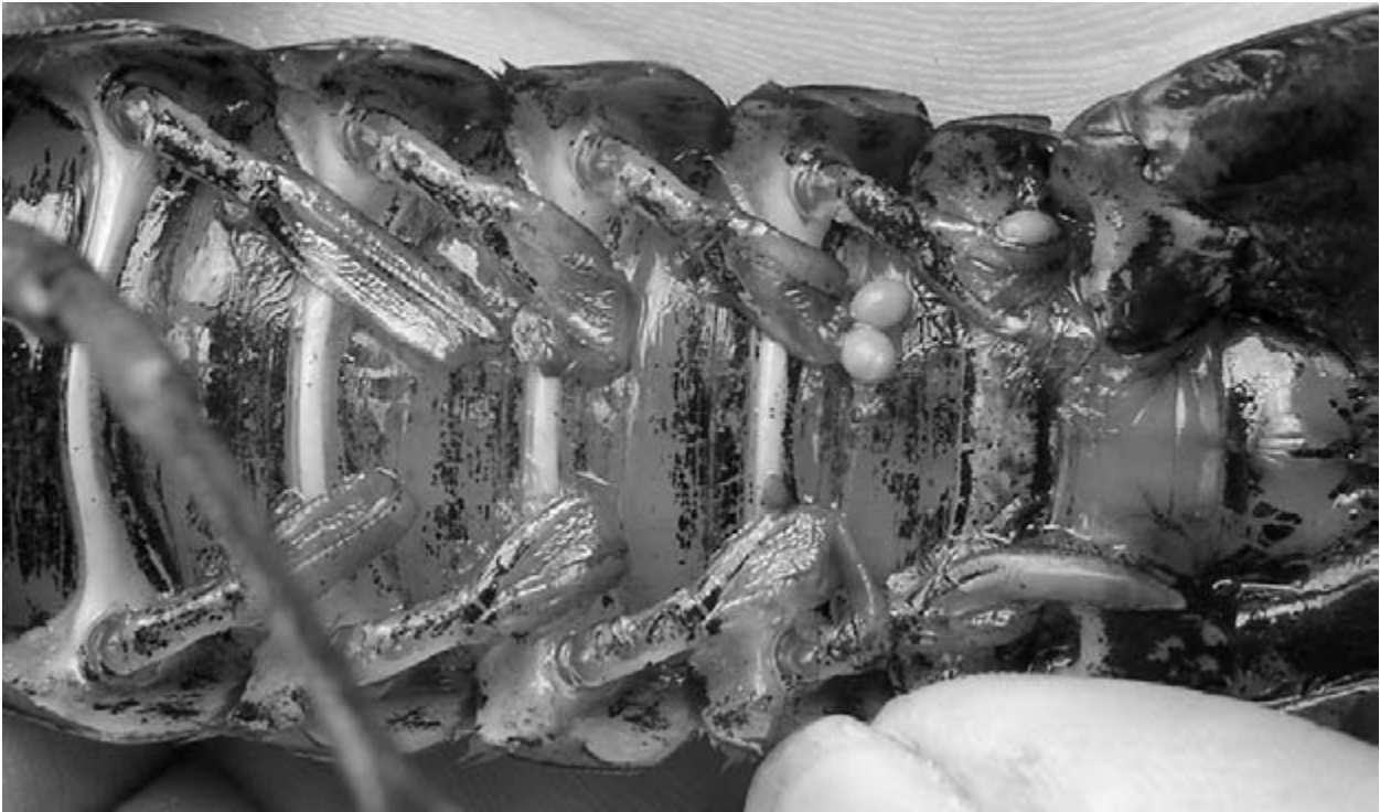
Figure 3. The eggs carried on one reproductive female Cherax quadricarinatus (below Emigrant Ck Dam). The female had been retained alive in a bucket by a recreational fisher.

however, Jones (1990) found that C. quadricarinatus has a high salinity tolerance, with 70% survival rates in 24ppt salinity over 21 days. Therefore, the species may be capable of overcoming the brackish nature of the junction of Emigrant creek and Richmond River, particularly during flood events. At these times, the sudden influx of freshwater could translocate crayfish downstream, from where they might migrate back up into other areas of the Richmond catchment.