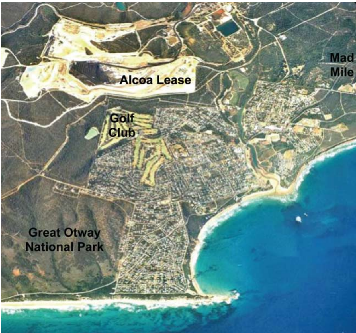
Figure. 1 Aerial photograph of Anglesea, Victoria, showing locations referred to in the text.