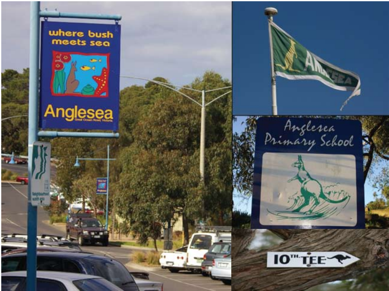
Figure. 2 Montage of images of kangaroos in Anglesea. Clockwise from left: banners in the shopping centre, flag of the Anglesea Golf Club, sign at Anglesea Primary School, sign at Anglesea Golf Club.