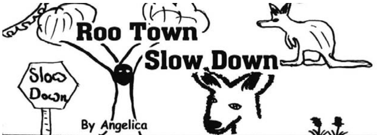
Figure. 3 One of the bumper stickers designed by Year 6 students at Anglesea Primary School.

This paper covers aspects of development of the kangaroo management plan for Anglesea. We report on a population survey of the golf course, to determine the abundance of kangaroos at the site with the largest concentration of kangaroos in the town, and report on an analysis of road-kill data in an attempt to quantify the extent of this problem. We also outline the process of community consultation, which identified the key kangaroo issues, and led to the formulation of the management plan.