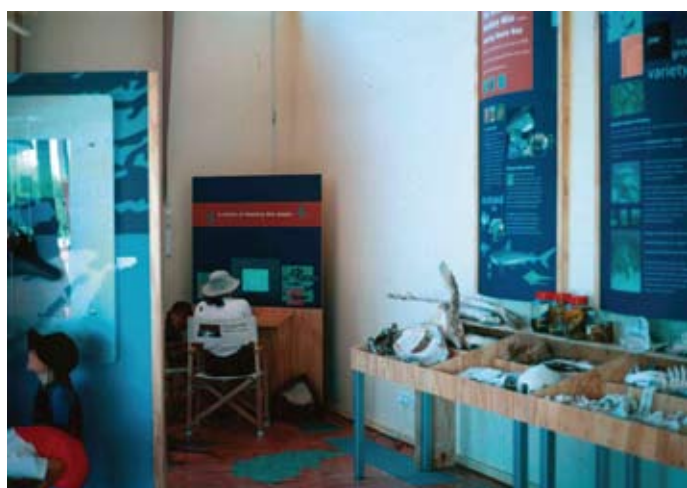
Figure 20. Monkey Mia Dolphin Interpretation Centre. Such facilities facilitate the delivery of education and interpretation. Information can be presented on local fauna and flora and there is the opportunity for face-to-face contact with staff. A particular advantage is the potential for the application of a wide range of techniques including audiovisual presentations, interactive displays and the opportunity to handle various objects such as bones, skulls and models (Newsome et al. 2002).

The educational component of the dolphin-feeding program at Tangalooma was used by Orams (1997) as an opportunity to assess the effectiveness of environmental education as a mechanism to promote ecologically desirable changes in the attitudes and behaviour of tourists. He concluded that both visitor enjoyment and knowledge increased following the education programme. Orams (1997) also found that the structured education programme was more likely to increase environmentally responsible behaviour. This work is an example of the importance of education programmes in informing the public about how to behave and can increase their knowledge of wildlife