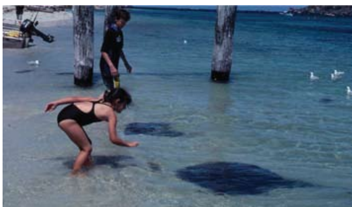
Figure 9. Unstructured feeding of stingrays at Hamelin Bay, Western Australia. Some of the issues identified were risk of rays being damaged by boats, overfeeding, feeding the wrong food, ignorant behaviour of visitors, skin lesions on rays as a result of excessive touching by visitors, damage to rays from fishing hooks and water pollution (see Lewis and Newsome, 2003 and Newsome et al. 2004).

devils feeding on carcasses placed in a natural setting where tourists view the feeding activity from a hide (Nick Mooney, pers. comm.). The tours operate no more than five days a fortnight and no more than three days in a row to avoid devils becoming dependent on the food.