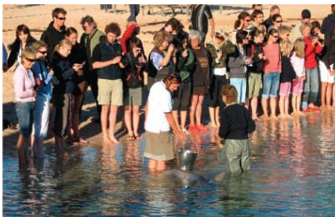
Figure 8. The structured feeding of dolphins at Monkey Mia Dolphin Interaction Area, Western Australia. Feeding takes place 3 times a day anywhere between 8am and 1pm attracting crowds of up to 700 people. Staff stand in the water with buckets containing fish while educating visitors on the dolphins and the history of Monkey Mia. Following this several tourists are chosen from the crowd to come into the water and feed a fish to the dolphins.