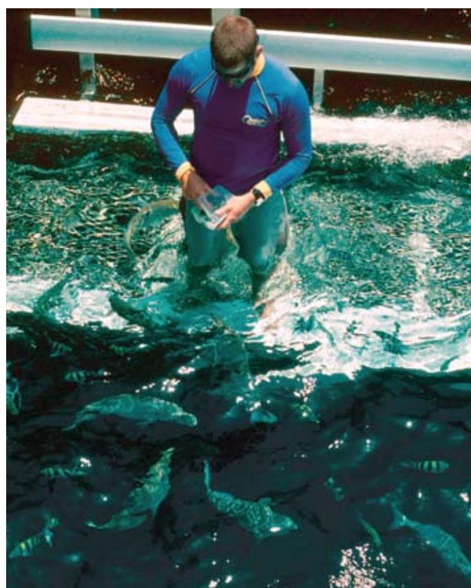
Figure 19. The feeding of fish forms part of the natural attractions available at the Great Barrier Reef Marine Park and attracts more than 1.7 million tourists per annum.

2. Dolphin provisioning occurs at a specific area of the beach, marked by buoys. Signs landward and seaward state that the area is off-limits to swimming, fishing and boating activities at all times. Participants are required to be at the site 30 minutes prior to the scheduled feed time, and are given a briefing before the feeding regime. Briefings include behaviour in the presence of dolphins such as no touching, the need for minimising pollution such as avoiding the use of insect repellents and sun screens and reasons are given for the short period that visitors are allowed in the water.