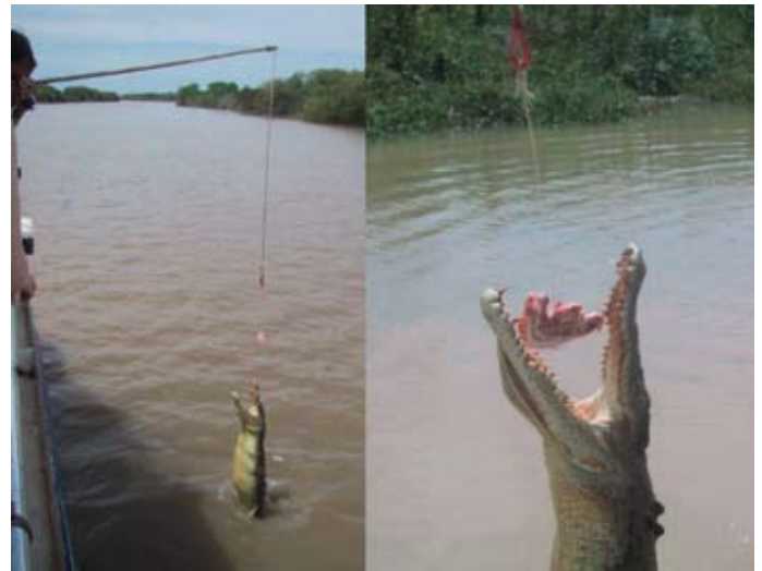
Figure 12. The structured feeding of crocodiles takes place on the Adelaide River in the Northern Territory, Australia to enhance the tourism product. Meat is delivered from the side of the boat to encourage crocodiles to jump. This allows for not only greater photographic opportunities but also the excitement of seeing the crocodiles jump.

Feeding is attractive to tour operators because it adds to the value of the tourism product by increasing the chances of sighting the wildlife on which they base their businesses. This is particularly the case in Australia where many of the native species are nocturnal and crepuscular. Provisioning of food can create opportunities for tourists to interact with these animals (Hodgson et al. 2004). For example, the structured feeding of semi-captive rare and charismatic fauna (which are often difficult to view) at Barna Mia in Western Australia. Here the wildlife are surrounded by electrified fence to keep feral predators, such as foxes Vulpes vulpes , out. Guided walks are offered which include the feeding of the captive wildlife to attract them to the visitor groups. Visitors can also take part in the feeding process. Visitors have reported a great sense of satisfaction with this experience (Hughes et al. 2005). Without reliable wildlife viewing the economic viability of tour operators businesses can be compromised (Orams 2002).