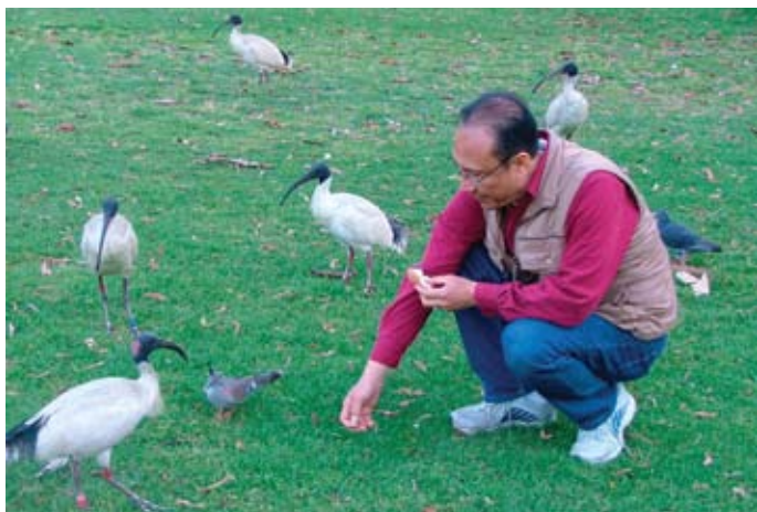
Figure 5. Unstructured and casual feeding of birds in Sydney Botanic Gardens. Sacred Ibis Threskiornis aethiopicus (prominent in this photograph), various species of pigeon and flocks of up to 30 Sulphur-crested Cockatoo Cacatua galerita are attracted to and regularly fed by visitors to the gardens.

as at Lake Monger, Western Australia (Fig. 6) and feeding fish to the pelicans outside a fish and chip restaurant on the Gold Coast, Australia (Fig. 7). Backyard feeding is also classified as unstructured feeding. Attracting wildlife to suburban back yards is extremely common throughout the Western world (O'Leary and Jones 2006). Studies in Australia have found 40-60% of households undertake some form of wildlife feeding (Jones and Howard 2001). In North America it is estimated that 63-80 million people feed birds during winter (Wilson 2001). In the UK wild bird feeding is supported by conservation organizations such as the RSPB, which provides advice on what to feed to birds (see Fig. 1).