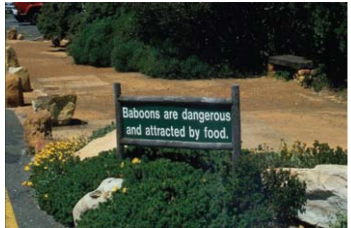
Figure 3. Warning sign Cape Peninsula National Park, South Africa. There is a blur between wildlife tourism and general recreation. Incidental feeding can evolve into a regular pattern of deliberate feeding as animals are attracted to picnic sites and day use areas. The feeding of primates is particularly problematical due to close approach of the animals and individual behaviours that lead to animals 'controlling' the feeding situation.

Because of the perceived disadvantages in feeding wild animals (e.g. Green and Higginbottom 2001; Higginbottom 2004; Newsome et al. 2005) sitting alongside variable human interests, expectations and attitudes towards wildlife, there are the different and conflicting perspectives as to whether feeding is desirable or not and in many cases debate as to how wildlife feeding should be managed. Moreover, problems of inappropriate feeding, risks to wildlife and public safety are issues that many local authorities, councils and land management agencies have to deal with (e.g. Fig. 3).