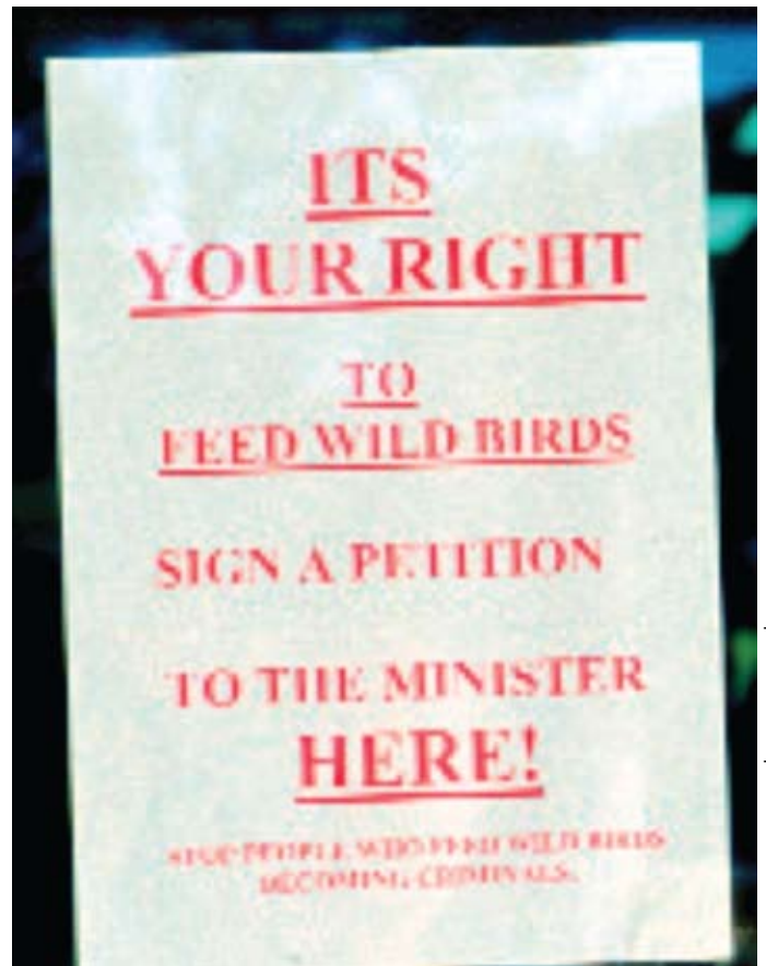
Figure 17. In some situations people feel it is their choice and prerogative to be able to feed wildlife. This poster was positioned in the front window of a garage and retail outlet in Albany, Western Australia and reflects public indignation at the potential banning of feeding wild birds by a local tour operator.

Although Newsome et al. (2005 p209) state that 'management should aim to restrict formal feeding activities' the fact that wildlife is an important reason for many people visiting natural areas around the world, along with the educational, environmental protection and economic potential of tourism, food provisioning is likely to continue as an aspect of many wildlife viewing situations. A further reason for the likely continuance of feeding activities is that many countries promote their wildlife as part of tourism marketing strategies and that the global interest in nature based tourism is increasing along with increasing recognition that tourism can contribute to the conservation of species and their habitats. Furthermore, as international travel and tourism continue to rise people with expectations of feeding