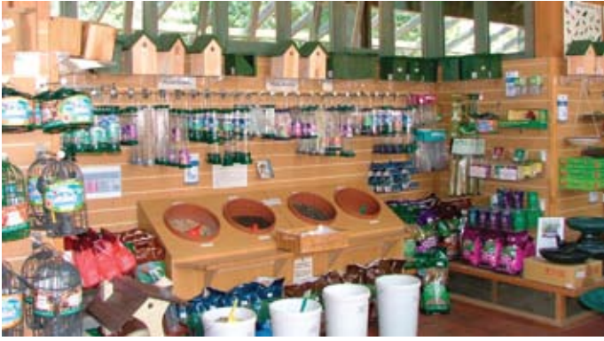
Figure 1. Shop on the Royal Society for the Protection of Birds Reserve Minsmere, England selling a wide range of feeding apparatus and various wild bird foods and seed mixes. Minsmere hosts special events for children that include making bird feeders and bird cake. Slimbridge, in southern England, is another location that sells bird food. Wild bird feeds take place at the Peng Observatory at Slimbridge from January to March. There are special evening floodlit sessions with a commentary educating the public about the feeding of birds during winter.

to see, and/or wildlife that occurs in specific locations, are fed as part of a tourism attraction. Because wildlife tourism is a means of learning about wildlife and the way that most people come into contact with exotic, rare and charismatic species this chapter seeks to explore the spectrum introduced above. It is thus necessary to take on a global view, so that the wildlife-feeding situation, particularly from a tourism perspective, can be fully appreciated.