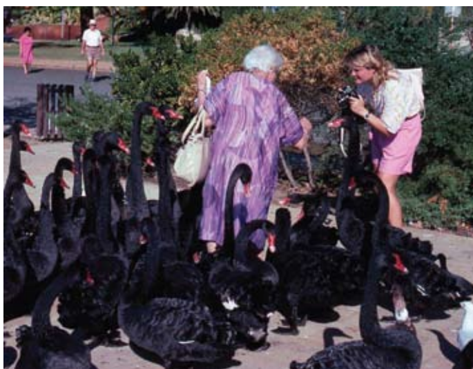
Figure 6. Unstructured feeding of birds taking place at lake Monger, Western Australia. Over time the practice of feeding swans and ducks became very popular resulting in the site being targeted as a visitor attraction by bus tour companies. Risks to the health of wild birds due to the use of bread, the attraction of nuisance species such as Silver Gulls ( Larus novaehollandiae ), pushy behaviour of the swans and the risk of wild birds being killed on nearby roads has resulted in food provisioning being prohibited at lake Monger.