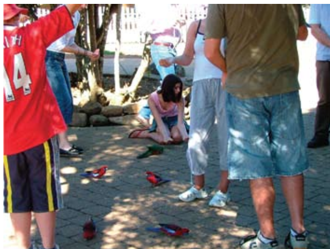
Figure 16. The feeding of birds at O'Reillys Guesthouse, Queensland. Here management strategies include the selling of seed to visitors and the construction of a designated paved feeding area that can readily be cleaned and maintained.

An additional problem is the feeding of continuous amounts of the same or the wrong types of food resulting in the malnourishment of wildlife and reduced condition. Semeniuk et al. (2007) have examined the diet of provisioned stingrays in the Cayman Islands. They compared the blood fatty acid levels of provisioned and non-provisioned rays. It was found that the squid fed to rays does not provide a diet comparable to that of non-provisioned rays with respect to essential fatty acids. The long-term implications of such physiological condition remain unclear but the results suggest that fatty acid profiles can be a useful indicator for the future monitoring of food-provisioned stingrays. A similar study undertaken by Ishigame et al. (2006) in Brisbane, Australia examined the physiological effects of backyard feeding of Australian magpies Gymnorhina tibicen and found that the plasma cholesterol of wild magpies to be affected by backyard feeding. Ishigame et al. (2006) suggested that the current levels of food provisioning could influence the population ecology of magpies. However, a study of the foraging and breeding ecology of food-supplemented magpies conducted by O'Leary and Jones (2006) found that the birds were not reliant on supplemental feeding.