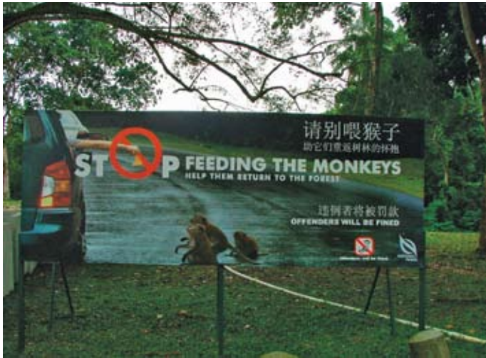
Figure 4. Do not feed the monkey signage at Bukit Timah Nature Reserve, Singapore. Despite the signage and risk of penalties visitors to the reserve have been observed checking for management presence and then secretly giving food to the monkeys.

(e.g. feeding of dolphins, Australia). Accidental feeding involves the wildlife acquiring food from disposal areas (e.g. dingoes Canis lupus dingo Fraser Island, Australia), discarded food wastes (e.g. bears in North America) or by stealing directly from the tourists themselves (monkeys in Africa and Asia, see Fig. 4) (Newsome et al. 2005). The spectrum of wildlife feeding activity, which includes both accidental and intentional feeding, can be categorised as inadvertent, via habitat modification, unstructured or structured. All of these have the potential to have both positive and negative impacts on wildlife.