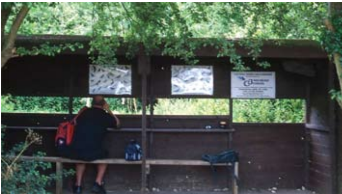
Figure 2. Bird feeding devices such as 'nut feeders' (directly in front of the viewer) provide enhanced viewing opportunities (value added tourism product) at a bird hide at Rutland Water, UK.

to see, and/or wildlife that occurs in specific locations, are fed as part of a tourism attraction. Because wildlife tourism is a means of learning about wildlife and the way that most people come into contact with exotic, rare and charismatic species this chapter seeks to explore the spectrum introduced above. It is thus necessary to take on a global view, so that the wildlife-feeding situation, particularly from a tourism perspective, can be fully appreciated.