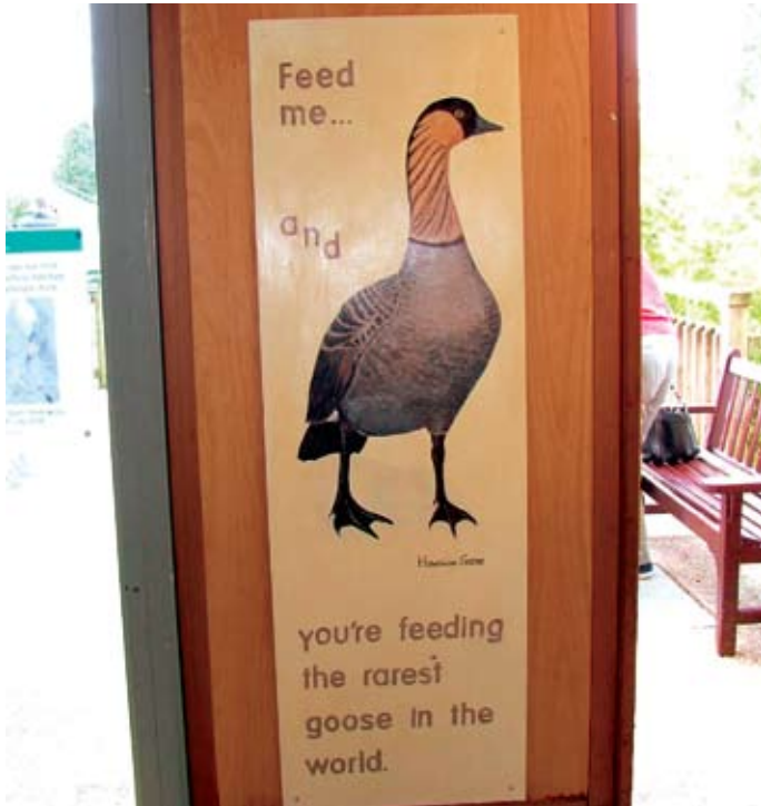
Figure 10. The Slimbridge Wetlands Centre, England contains the world's largest captive collection of wildfowl including the endangered Hawaiian Goose. Formulated mixes can be purchased and visitors feed many species of wildfowl that roam the ground freely or are otherwise on display in open pens.

but operators seem to have developed their own code of ethics. Furthermore, the Parks and Wildlife Commission have no plans to regulate or introduce a permit system. Yet, the potential impact of crocodile feeding tours on crocodile behaviour, such as attraction to recreational boats, is an important issue for not only the conservation of saltwater crocodiles Crocodylus porosus but also the sustainability of the tourism activity.