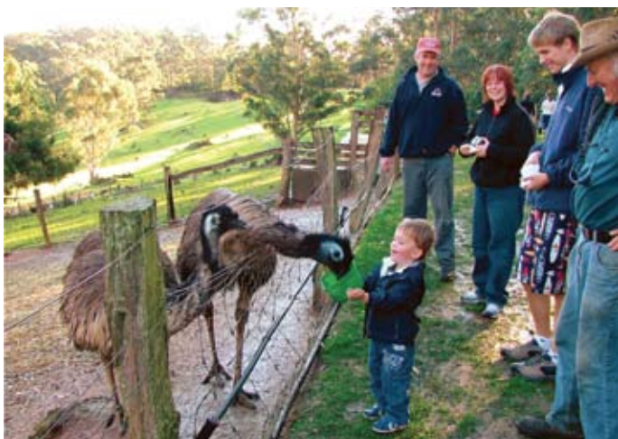
Figure 11. This photograph highlights the enjoyment of feeding captive emus Dromaius novaehollandiae . Structured feeding in a captive situation allows for visitors to interact with animals which can often be difficult to view in the wild. Feeding wildlife can bring great enjoyment as well as providing the opportunity for education and interpretation.