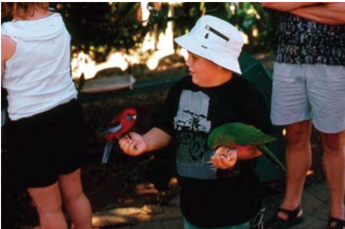
Figure 18. The feeding of birds at O'Reillys Guesthouse, Queensland.

Famous as a site for bird watching O'Reillys Guesthouse, Queensland, Australia has scheduled natural history programmes comprising bird watching tours. There is a strong commitment to environmental education and sustainable tourism. Bird feeding is a very important part of the ecotourism services offered by the guesthouse, which has a visitation profile of 300,000 per annum with the day visit component being 264,000 (Fig. 18). There are 36,000 overnight stays and 50-60% repeat visitation. Bird feeding has been in operation since the 1920's. Problems were recognized early on when day-trippers were feeding birds bread, chips and other unsuitable food items. Seed was provided in order to avoid this but coach drivers and some tourism operators were observed to be providing their own supply of the wrong mix of seed. As part of a strategy to counteract this in 1988, formulated seed was sold to visitors. This was combined with feeding under supervision at a designated feeding station and the construction of a paved feeding area that can be readily cleaned (See Figs 16 and 18).