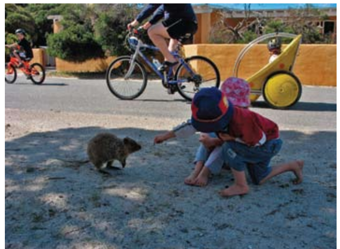
Figure 14. Illustration of unstructured feeding of quokkas on Rottneest Island, Australia. Even though management does not encourage this practice feeding is still a common occurrence.

become habituated to human contact, particularly through feeding. This can result in animals becoming dependent on humans to feed them (Orams 2002). Such continual feeding can also create semi-domesticated wildlife. For example, on Rottneest Island, Western Australia quokkas Setonix brachyurus have become so habituated to humans and feeding they have little if any fear of humans (Fig. 14). Quokkas have even been observed stealing food from plates at the outdoor restaurants while diners look on (pers. obs. K. Rodger; Herbert 2007).