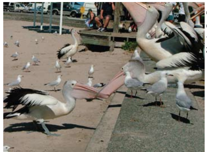
Figure 15. Pelicans fighting over a fish. These two pelicans remained joined with neither willing to retreat until tourists stepped in to break them up.

The feeding of wildlife can also result in changes to intra-species interactions such as social relationships that may result in animals being injured while competing for provisioned food. An example is the feeding of pelicans Pelecanus conspicillatus on the Gold Coast, Australia. Individual pelicans were seen to have long battles with each other, caught together by their beaks in an effort to obtain food (Fig. 15). In addition to this, when wildlife are fed by humans changes in the composition of animal communities may be seen. Larger more aggressive species or individual animals may displace the less dominant species. This is because the more aggressive species are likely to successfully access the human-provided food (Orams 2002). For example, at Hamelin Bay, Western Australia stingrays Dasyatis thetidis and Dasyatis brevicaudata were seen to fight over large pieces of fish offal. If the rays approached the provisioned food from a similar angle one will slide a pectoral fin under the other and forcefully push it away. Also if the eagle rays Myliobatis australis tried to approach the food they would be chased up the beach or in some cases the stingrays would pin them to the sand (Newsome et al. 2004).