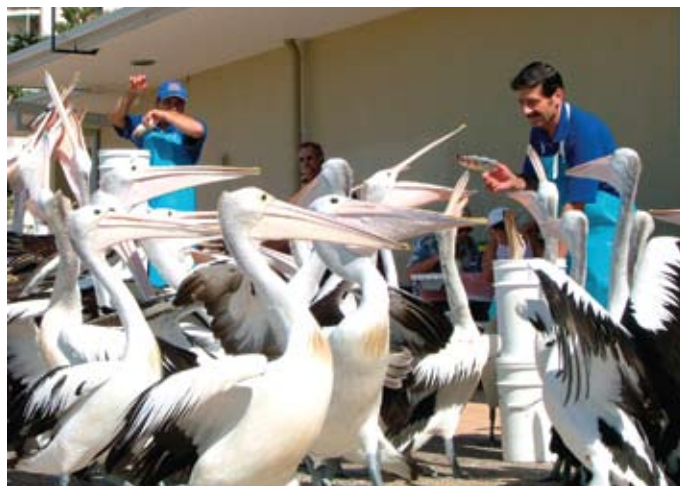
Figure 7. The unstructured feeding of pelicans outside a popular fish and chip restaurant on the Gold Coast, Queensland. Here the daily feeding can attract over 20 pelicans and crowds of up to 50 people.