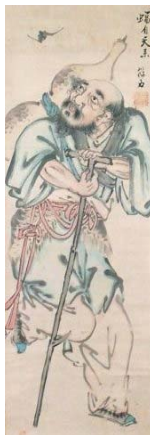
China – A bat descends from heaven