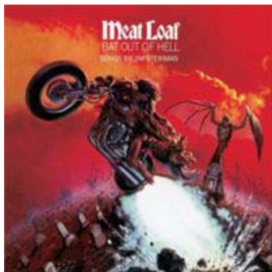
"Like a bat out of hell I'll be gone when the morning comes" Meatloaf 1977