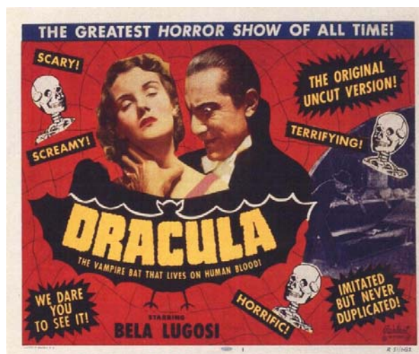
1931 film poster, promoting Bela Lugosi’s genre-defining role as Dracula. Note the reinforced message from the spider-web background.

Dracula is an 1897 novel by Irish author Bram Stoker, featuring as its primary character the vampire Count Dracula. No matter that “Stoker’s novel deals in general with the conflict between the world of the past – full of folklore, legend, and religious piety – and the emerging modern world of technology, logical positivism and secularism” ( http://en.wikipedia.org/wiki/Dracula , accessed 1/8/07) – the book’s and film’s legacy is a perception of bats as dark, evil, bloodsucking monsters. If Martin Cruz Smith’s (1977) novel Nightwing were to follow in this path from novel to film, with the added mystical dimension of Hopi Indians, then we can predict a harder life for bats to gain acceptance in the public imagination. In fact, that part of the world, south-western USA, has recently released a film in that horror genre.