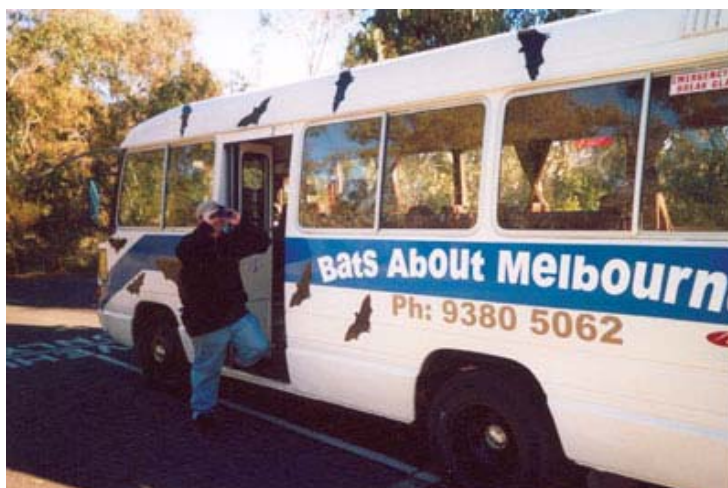
Bat tourism is an essential part of efforts to dispel myths and change public attitudes to bats

Unfortunately many [bat] roost sites are today threatened by disturbance from tourism, recreational caving, mineral exploration and mining activities. Safety concerns and the management of visitors in old mine sites is a major issue for land management agencies and has, in the past, been