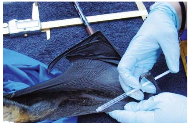
Figure 5 The bat is anaesthetised by intravenous injection of Alfaxan-CD RTU. The vein running along the leading edge of the wing is easily accessible, however, vein constriction was observed under cold weather conditions.

In the morning, the flying-foxes were processed in the order of capture (with the exception of females in their early pregnancy or late lactation, which were processed first) within approximately 3 h following the mist-netting. Each animal was weighed still in a pillowcase to the nearest 5 g using a 1.5 kg Pesola spring scale. The right wing of a flying-fox was then exposed from the bag, and the anaesthetic Alfaxan-CD RTU (0.20–0.50 ml/kg; we used between 0.20–0.34 ml) was injected intravenously at a slow rate (10–20 seconds), to reduce a chance of apnoea (Figure 5). Animals were expected to fully recover within an hour past the induction.