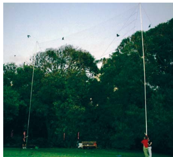
Figure 3 Mist-net strung between two 13.2 m aluminium masts, at the height of the tree canopy.