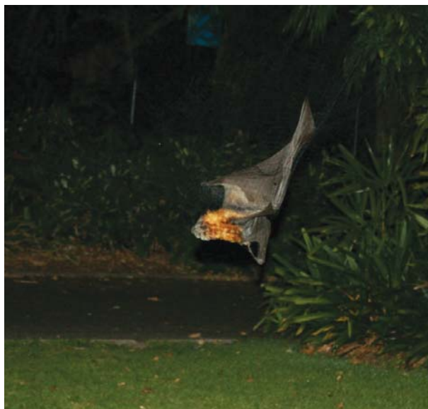
Figure 4 When a flying-fox hits the net, it is lowered to approximately 1 m off the ground. The animal is immediately disentangled and placed in a calico bag/pillowcase.