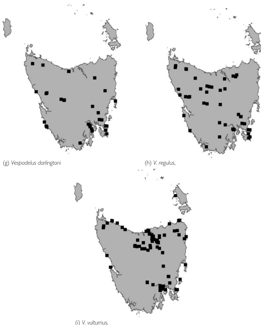
Figure 2. (Cont'd) Known location records for bats in Tasmania.

In Australia, there have been only a small number of records of bats colliding with wind turbines. However, most wind farms are not being monitored for collisions. Monitoring for bird and bat strikes at Bluff Point Wind Farm in north-west Tasmania has been carried out since