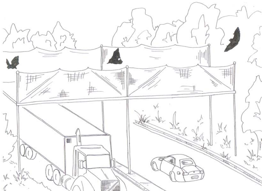
Figure 3 Artist's impression of the bat fly-over across the Pacific Highway at Artarmon.

For the flyover bridge to become a reality, the immediate area on either side of the highway could not be rezoned for high-rise development. In addition, Council and residents would need to be supportive of the project and to understand how they can contribute to the conservation of the bats in their local area. Finally, government agencies, such as State Rail, need to be included in the project as bat flyways on railway land needs to be maintained in the long-term. Many stakeholders need to be involved in the development of the connecting tree corridors and fly-over bridge. The benefits of creating commuting habitats for bats needs to be fully explained to and understood by local residents and business people if the project is to succeed. The enhanced plantings and extended tree canopy will also provide additional habitat for other native species such as possums and birds.