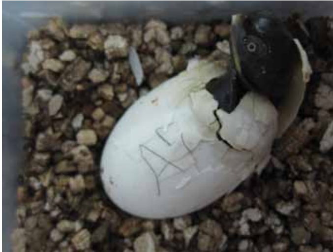
Emydura macquarii hatching.