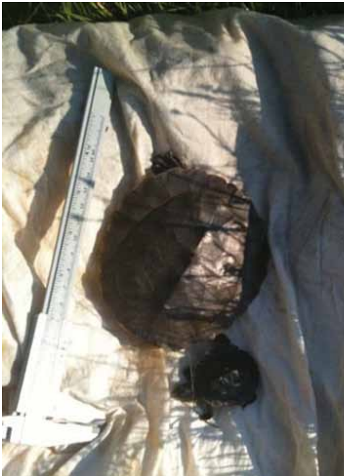
Two turtles released last year, showing the size difference in hatchlings of similar ages (within 2 weeks of each other) kept in high population density.