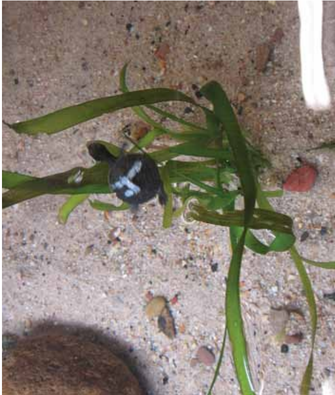
Hatchling Emydura macquarii in a pond at UWS Hawkesbury campus.