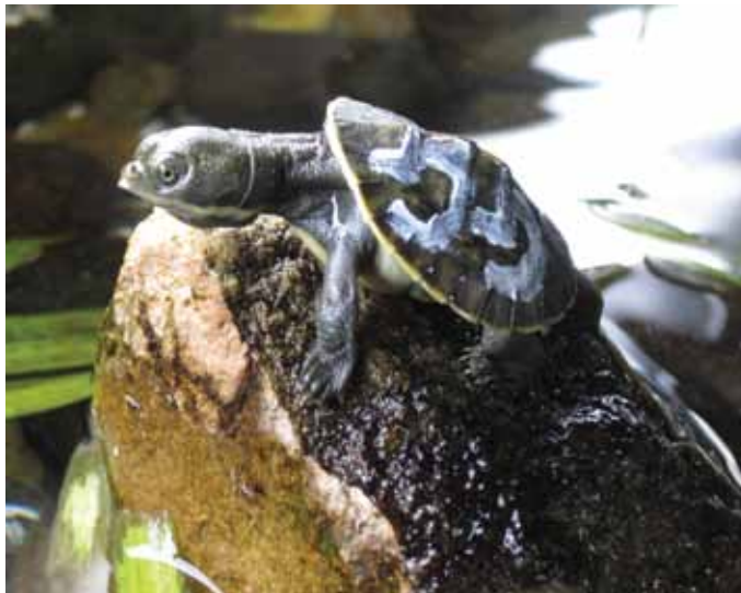
Emydura macquarii hatchling on rock.