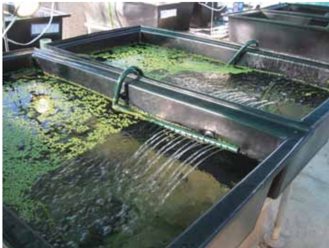
Pond set-up of experiment at UWS Hawkesbury campus.