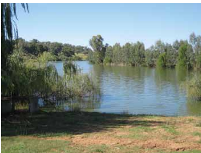
Area of Murray River that Emydura macquarii in this study were caught.