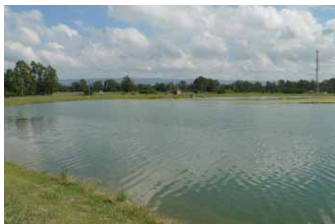
Figure 1. An example of a purpose-built, turkey nest dam used to store effluent on the Hawkesbury campus of the University of Western Sydney, and used as one of the replicates for the stormwater treatment.

Sampling was undertaken at nine dams: three that were used to store treated sewage effluent, three that stored stormwater, and three dams that did not receive supplementation from either of these pollution sources.