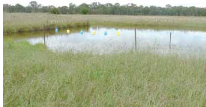
Figure 3. Three trapping units on the edge of a farm dam used in the invertebrate student research experience showing three of the four trapping stations set at the cardinal points of the compass.