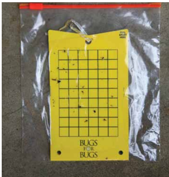
Figure 5. Yellow sticky trap showing grid, placement in plastic zip lock bag, and an example of the catch (since this was a 'prototype' there is no hole at the centre right for orientation.)