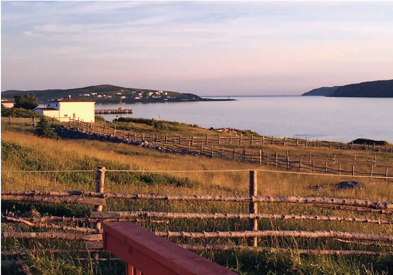
FIGURE 1: Harbor view.