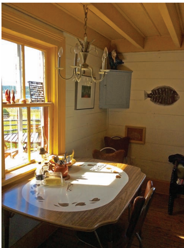
FIGURE 4: The chrome set.