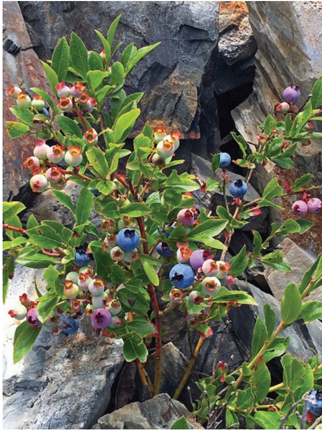
FIGURE 5: Blueberries .

canes grow down into hollows or up on hillocks. Picking blueberries is more grunt work. There are blueberries everywhere in Newfoundland, but rarely do we find the easily plucked highbush variety. In some places the berries huddle close to the ground, mingled with low spreading juniper and black crowberries, or lost among the thick-leaved kalmia, all cowed by the prevailing winds. We have recently acquired a berry rake, but I prefer to pull the deep blue clusters off the bushes by hand. I am more selective than my husband and my pail contains fewer green berries and leaves, though it takes me longer to fill my white plastic pork riblets container.