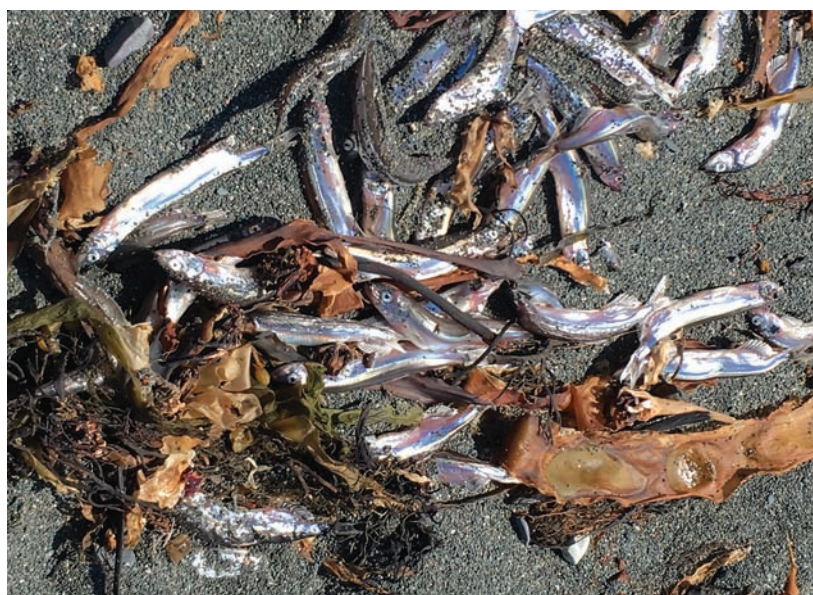
FIGURE 3: Capelin on the beach.