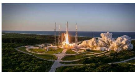
FIGURE 1 The OSIRIS-REx spacecraft launched aboard a ULA Atlas V 411 rocket on 8 September 2016 from Cape Canaveral Air Force Station, Florida (United Launch Alliance) (USA).

The spacecraft (Fig. 1) is currently on an outbound cruise trajectory that will result in a rendezvous with Bennu in August 2018 (Fig. 2). The science instruments on the spacecraft will survey Bennu to measure its physical, geological, and chemical properties, and the team will use these data to select a site on the surface to collect at least 60 g of asteroid regolith. The team will also analyze the remote-sensing data to perform a detailed study of the sample site for context, assess Bennu's resource potential, refine estimates of its impact probability with Earth, and provide ground-truth data for the extensive astronomical data set collected on this asteroid. The spacecraft will leave Bennu in 2021 and return the sample to the Utah Test and Training Range on 24 September 2023.