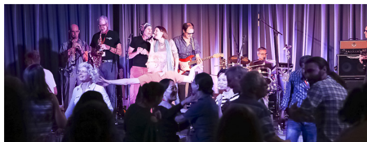
Goldschmidt Rocks party

As per Goldschmidt tradition, a full and diverse social program was offered to attendees. Attendees were able to discover Versailles at night and with fireworks, to walk through the Marie Curie Latin Quarter, to enjoy the traditional ice-breaker, to dance at the Goldschmidt Rocks party, to dine on the River Seine while discovering the wonders of Paris, and to enjoy special museum tours of the Louvre or the Musée d’Orsay. A total of 1,543 social tickets were sold this year, probably another record!