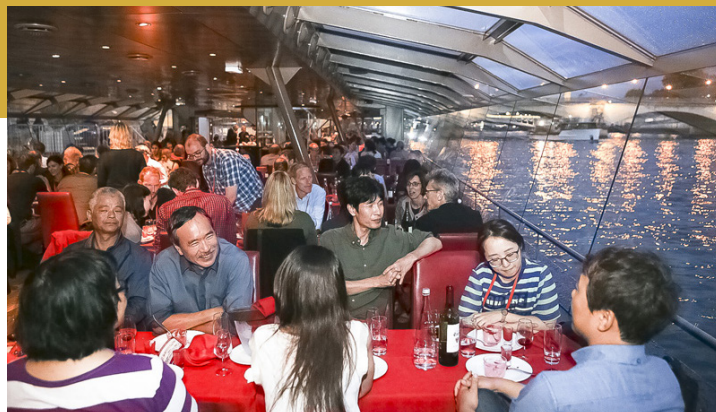
Dinner cruise on the River Seine

We take this opportunity to thank all of the workshop and field trip organisers.