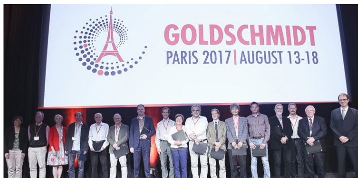
The Geochemical Fellows award ceremony.

Recognition of scientific excellence is at the heart of EAG and GS values, and this is perfectly illustrated by the 14 awards presented at this year's conference—another record! We congratulate all the medallists. The full list of medallists is available at https://goldschmidt.info/2017/medals-view . Interviews with some of the medallists can be found on the EAG Blog page for Goldschmidt2017 ( http://blog.eag.eu.com/category/goldschmidt2017/ ).