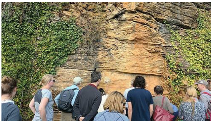
Field trip in Burgundy, France

Goldschmidt2017 broke yet another record with 14 pre-conference workshops, which were attended by 361 scientists. These workshops covered an array of subjects, from geochemical modelling, to understanding noble gases, to the environmental geochemistry of boron, and many more.