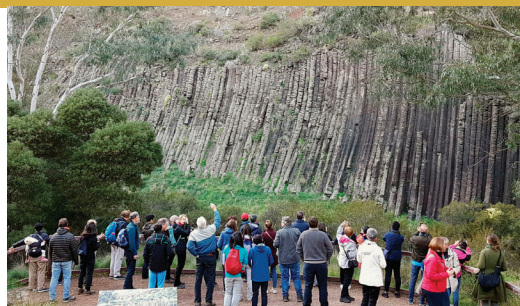
Excursion to Organ Pipes National Park in the outskirts of Melbourne.