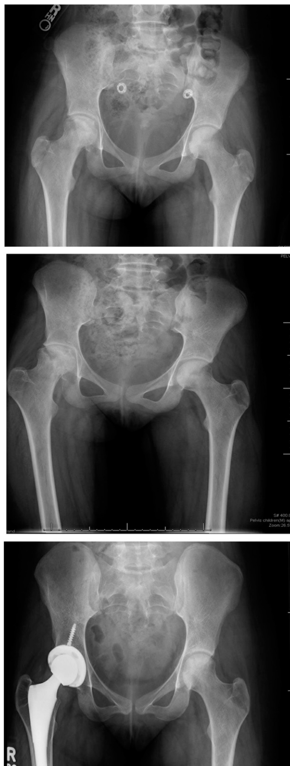
Figure 1. Serial plain films of the pelvis showing ONFH progression from (A) April 2013 (flattening of right femoral head [Steinberg stage IV]; normal on left), (B) February 2014 (reduced joint space; sclerosis and cysts on the right [Steinberg stage V] and minimal collapse without flattening on the left [Steinberg stage II]), and (C) April 2018 (prosthetic right hip and sclerosis without flattening of the left femoral head [Steinberg stage II]).

SCD is the most common cause of pediatric ONFH; an estimated 50% of adults with homozygous SCD (Hb SS) will develop ONFH by age 35 years old. 6 Systemic steroids, alcohol use, smoking, thrombophilia, cardiovascular disease, hyperlipidemia, and joint