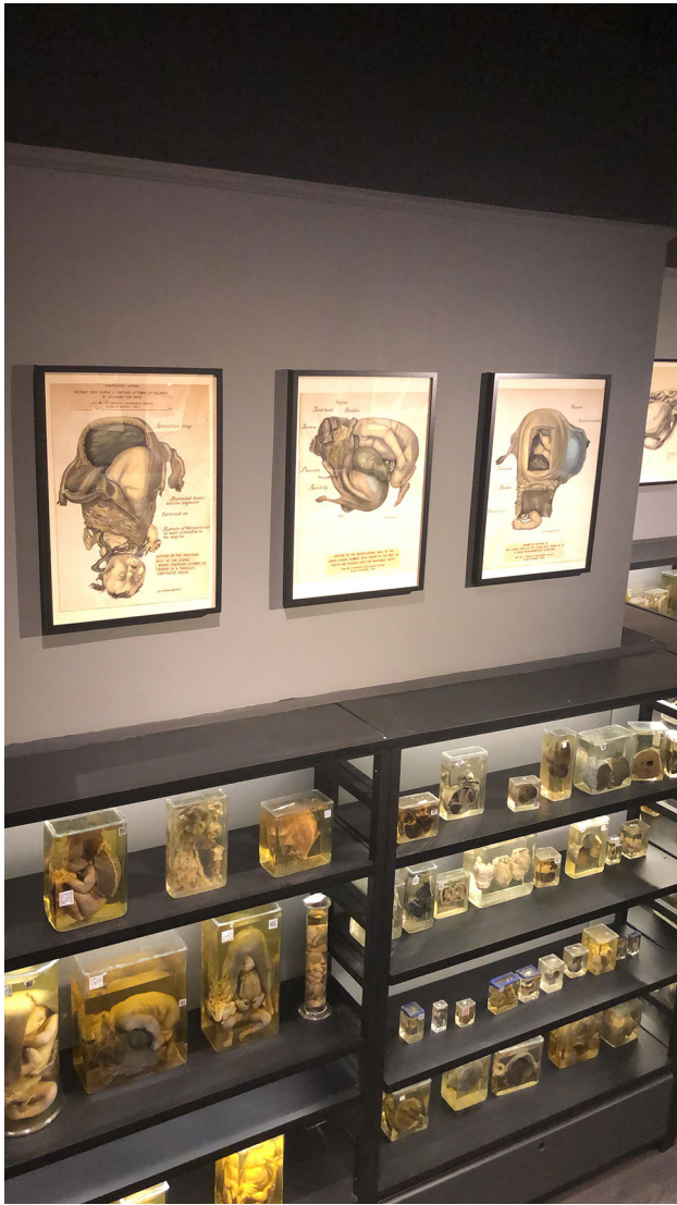
FIGURE 1. Specimen and color-plate illustrations from the Naguib Mahfouz Museum.

Should you ever visit Mahfouz's museum, reflect on the untold stories of those forcefully interred there. Beware that unnatural chill.