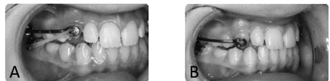
Figure 1. Carriere Motion appliance (A) before Class II correction and (B) after Class II correction.

Pretreatment and post-CMA CBCTs were taken with the iCAT FLX (Kavo Kerr, Brea, Calif) at a field of view size of 16 cm × 13 cm or 23 cm × 17 cm, and traced by