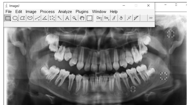
Figure 2. Regions of interest (ROIs) from three different areas in the mandible (condylar process, angulus mandibula, corpus mandibula).

Dental panoramic radiographs (DPRs) are a cost-effective and routinely used imaging method in dentistry. In addition to demonstrating changes in the dentition, DPRs can also be used to evaluate structural changes in trabecular bone. 9 One of the evaluation methods available is fractal dimension (FD) analysis, a mathematical method used to measure and assess complex structures such as trabecular bone. 10–12 In FD analysis, the trabecular bone pattern is evaluated using a box-counting algorithm that quantifies the bone