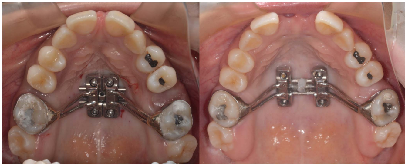
Figure 1. MARPE design with four miniscrews (two anterior: 1.8-mm diameter, transmucosal of 4 mm and 7 mm of thread length and two posterior: 1.8-mm in diameter, transmucosal of 4 mm and 5 mm of thread length).

Persson and Thilander 5 and Angelieri et al. 6 reported that the degree of consolidation in the midpalatal suture exhibits great individual variability and it may not be correlated with chronological age only. Therefore, Angelieri et al. 6 developed a classification of suture maturation based on cone-beam computed tomography (CBCT) images, determining stages from A to E to define the degree of consolidation of the midpalatal suture.