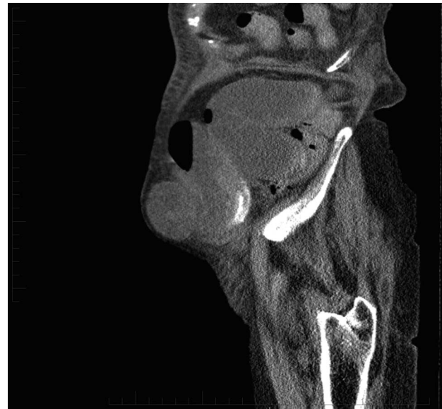
Fig. 2 Sagittal computer topography images of the patient on postoperative day 5. A hernia can be visualized in the left iliac fossa at her left flank laparoscopic port site.

A literature search was conducted in Ovid and Cochrane databases using the following search strategy: ((Port site hernia) OR (Laparoscopic port hernia) OR (trocar site hernia)) AND ((5-mm) OR (5mm) OR (five mm)). The date last searched was 29 May 2016. Reference lists of relevant studies were searched by hand to identify additional publications. Studies were excluded if they were not written in English or did not specify port size. Studies