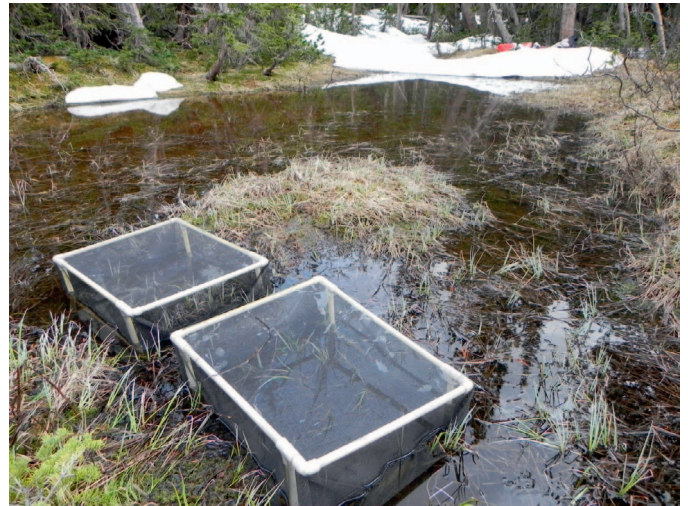
FIG. 2. Photograph of two caged Boreal Toad egg mass halves at Spruce Lake. The paired exposed egg mass halves are not visible, but located directly adjacent to each cage.

Embryo Survival: Data Collection. —We explored the potential effect of Cutthroat Trout presence on survival probabilities for