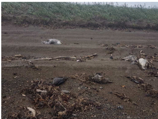
FIGURE 2. Northern Fulmar ( Fulmarus glacialis ) and Short-tailed Shearwater ( Ardenna tenuirostris ) found dead near the village of Gambell on St. Lawrence Island in the Bering Strait on 12 August 2017.

( Aethia spp.), kittiwakes ( Rissa spp.), gulls ( Larus spp.), puffins ( Fratercula spp.), and Fork-tailed Storm-petrels ( Hydrobates furcatus ; USGS 2019). Clinical signs from moribund birds included weakness, lethargy, drooping heads, staggering, and lack of predator avoidance (USGS 2019); similar signs have been reported in other cases of HAB intoxication among birds (Shumway et al. 2003; Gible and Hoover 2018). The large