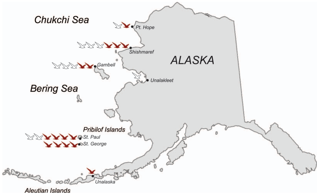
FIGURE 3. Map showing locations and numbers of seabird carcasses tested for saxitoxin (STX) during a 2017 multispecies die-off in the Bering and Chukchi seas. Solid (red) indicates individuals with detectable levels of STX ( n=15 ); empty (white) indicates individuals with no detectable STX ( n=10 ). Carcasses were collected opportunistically and surveying efforts were not consistent across regions; however, all available samples were tested from each location.

did not detect DA in any tissues ( n=36 from 22 individuals; Van Hemert et al. 2020a).