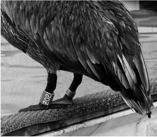
FIGURE 1. Oiled, rehabilitated, and tagged California Brown Pelicans ( Pelecanus occidentalis californicus ) released with GPS satellite Platform Terminal Transmitters were fitted with a large, plastic, green, uniquely numbered band on one leg and a metal federal band on the contralateral leg. Oiled birds had bands with the prefix “Z,” while tagged control pelicans had similar bands that were blue with the prefix “N.”

absence of compounding factors, such as previous illness, severe pododermatitis, or healed fractures (oiled, rehabilitated, and tagged birds [ORT]). Once pelicans were deemed healthy enough for release, they were instrumented and released at the recently decontaminated Gaviota Beach within 1 wk. We affixed 65-g solar-powered GPS satellite Platform Terminal Transmitters (PTTs; Geotrak Inc., Apex, North Carolina, USA) with a Teflon ribbon harness as described in Lamb et al. (2016) and shown in Figure 2. Birds were observed in aviaries for approximately 3 h after PTT (tag) attachment, to ensure that they were able to walk and swim (Lamb et al. 2016). All tagged birds were released the day after transmitter attachment, on 12 and 27 June 2015.