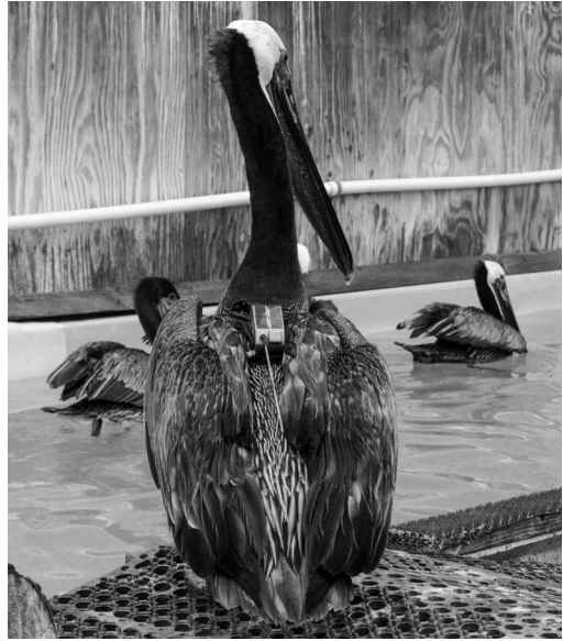
FIGURE 2. Oiled, rehabilitated, and tagged California Brown Pelicans ( Pelecanus occidentalis californicus ) were fitted with GPS satellite Platform Terminal Transmitters attached as backpacks with Teflon ribbon. The units weighed 65 g and were custom designed to have a sloping front edge to reduce drag during diving.

The online wildlife tracking database Movebank ( www.movebank.org ) was used to collect data from the PTTs. Initially, the duty cycle of the