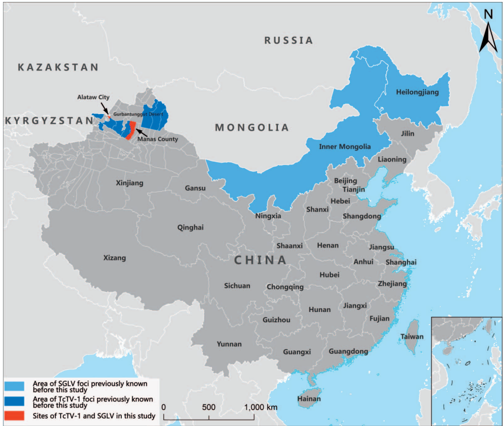
FIGURE 1. Map showing sites (in red) at which great gerbils ( Rhombomys opimus ) were caught and sampled for viruses during 2019–2021, providing new confirmed locations for Tacheng tick virus 1 (TcTV-1) and Songling virus (SGLV). Areas in which SGLV and TcTV-1 have previously been detected in China are also shown on the map, in pale blue and dark blue, respectively.

During 2019–21, 276 great gerbils were collected at 16 sampling sites in Alataw City (45°19'N, 82°56'E) and Manas County (43°28'N, 85°34'E), Gurbantünggüt Desert, XUAR (Fig. 1). The gerbils were captured using 390 Sherman live traps (30 cm × 15 cm × 15-cm wire mesh; Alataw City) baited with walnut, cucumber, or tomato. Traps were checked twice daily and rebaited whenever necessary; trap success rate was from 0.5% to approximately 3% (Kamranrashani et al. 2013; Zhao et al. 2020; Ji et al. 2021). To prevent the spread of highly pathogenic infections, the rodents were trapped and handled following biosafety guidelines (Mills et al. 1995). All wild rodents were morphologically identified by an experienced zoologist. The rodents in