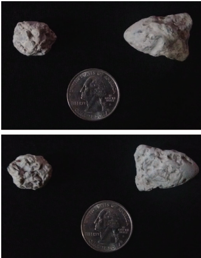
Figure 1. Superior and Inferior Views of Cole County Historical Society Minié and Musket Balls

other side had shallower but still substantial grooves present. The marks on the musket ball covered the whole of the ball, leaving no part unaltered.